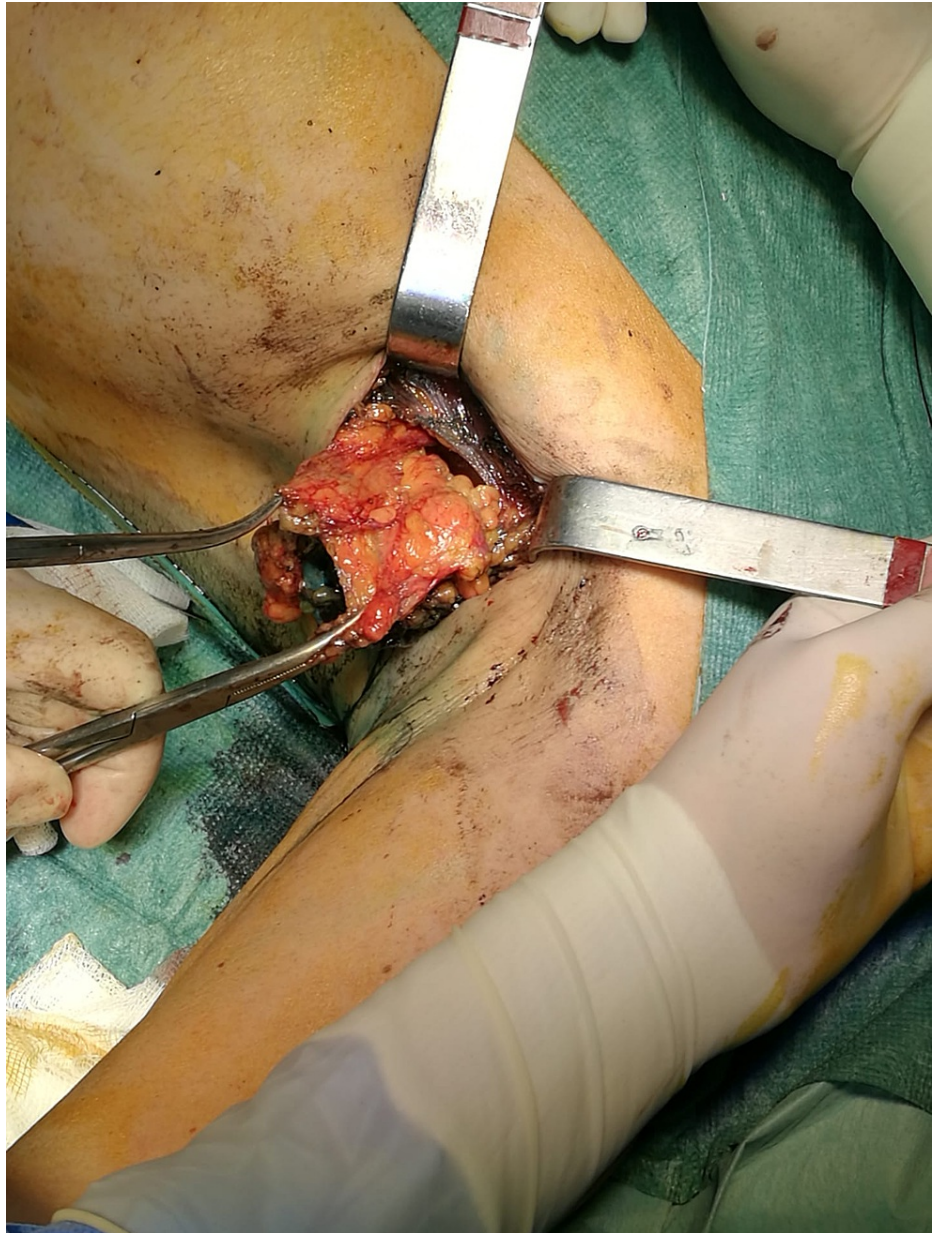
FIGURE 2: Extended excision with axillary lymph node dissection.

Final histopathology revealed 6 mm foci of invasive lobular carcinoma and seven nonmetastatic lymph nodes (Figures 3-4).