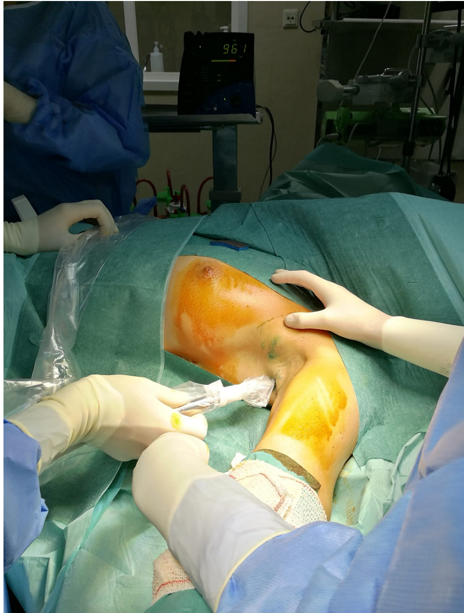
FIGURE 1: Sentinel lymph node identification protocol with gamma probe and blue dye (Dual technique).

After evaluation by a multidisciplinary board, the patient was proposed for an extended excision of the surgical scar and sentinel lymph node biopsy. At our institution, in eutopic breast cancer, we address axilla in conformity to ACOSG Z0011 (Alliance) protocol [9]. Axillary lymph node dissection is laid aside when only one or two positive lymph nodes are identified. The patient was submitted to excision of the remnant ectopic breast tissue with sentinel lymph node biopsy using a dual technique protocol with gamma probe and blue dye injection (Figure 1).