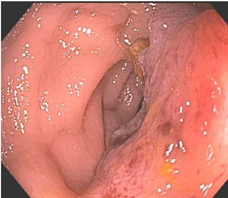
FIGURE 1: Noncircumferential, fungating, and ulcerated mass in the sigmoid colon.

of hematochezia and presence of anemia, the patient was admitted to the hospital and underwent a colonoscopy, which revealed a large, fungating, friable, and ulcerated nonobstructing mass in the sigmoid colon. The mass was noncircumferential, measured 4 cm in length, and was located 15-19 cm from the anal verge (Figures 1, 2). Biopsies were obtained with cold forceps for histology and the proximal and distal margins of the mass were tattooed. Histology showed invasive and moderately differentiated carcinoma without visible goblet cells. Given the patient's history of endometrial cancer, immunohistochemistry was performed and was consistent with an endometrial (endometrioid subtype) primary.