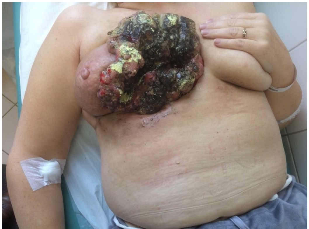
FIGURE 1: Picture of tumor before treatment

Six months later, in February 2017, she presented in the emergency room with symptoms of severe anaemia (blood haemoglobin 3,7 g/dL), Physical examination revealed bulky (7 X 15 cm), ulcerated, and actively bleeding carcinoma, eroding most of medial part of the right breast. The lesion was fixed to the chest wall and was producing an offensive smell (Figure 1).