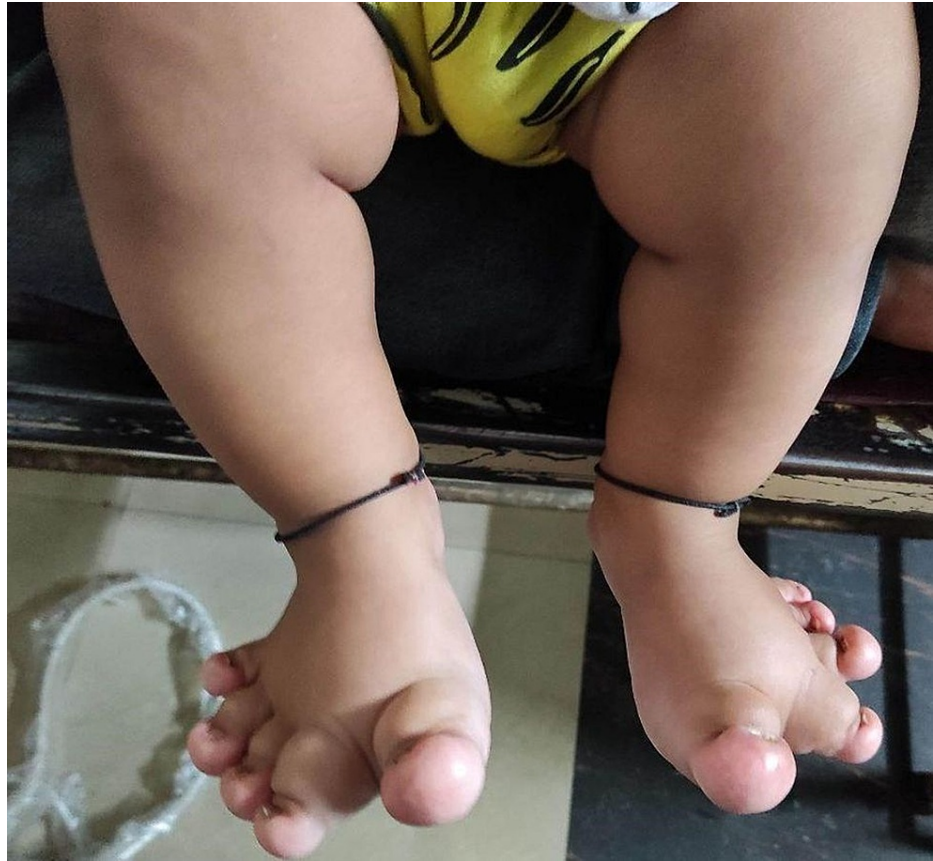
FIGURE 1: Abnormal enlargement of bilateral feet and all the toes.

The skin over this was thickened. It was non-tender with no evidence of oedema or bruit over the swelling. X-ray of lower limbs revealed bony hypertrophy and overgrowth of all the bones with increased soft tissue shadow of bilateral foot (Figure 2). No evidence of osteolytic or sclerotic lesions was seen, and no periosteal reaction was noted. On ultrasound evaluation of the lower limbs, there was increased soft tissue in both dorsal and plantar aspect of bilateral foot without any vascular malformation. To characterise the swelling better, magnetic resonance imaging (Figure 3A-3D) was warranted which revealed accumulation of excessive fat in the subcutaneous tissue without discernible capsule. Fibrous strand within the fat in bilateral feet, both in the plantar and dorsal aspect (more in plantar aspect), was seen. There was osseous hypertrophy and bony overgrowth without any cortical thickening. Core tissue biopsy was performed which showed abundant adipose tissue dispersed in mesh-like fibrous tissue and infiltrating the dermal connecting, suggestive of macrodystrophia lipomatosa. Currently, patient is advised for corrective surgery.