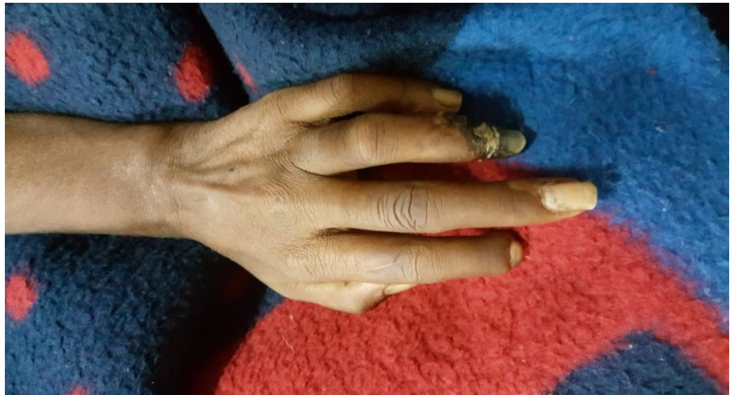
FIGURE 2: Sclerodactyly and ulceration of fourth finger

face. She had restricted mouth opening and taut skin over oral fissure bilaterally. She had sclerodactyly over both hands and calcinosis over the tips of the right index, middle, ring fingers and left ring finger as shown in Figure 2. Gangrenous distal phalanges of the index and middle fingers of the right hand and ring finger of the left hand were found. There was auto-amputation of distal phalanx of left index finger. Her small joints of the hand (metacarpophalangeal, proximal interphalangeal and distal interphalangeal joint) examination showed flexion contractures at the proximal interphalangeal joints of both hands. No erythema, swelling, or muscle wasting was noted. There was mild tenderness over proximal interphalangeal joints and restricted extension at proximal interphalangeal and distal interphalangeal joint due to pain. Her left elbow was swollen and was held in a flexed position and restricted movements in extension. There was a restriction of extension at 115 degrees due to pain. Her central nervous system examination showed a decrease in power in both lower limbs (2/5). She had loss of sensations below the knee bilaterally. The rest of the examination was unremarkable.