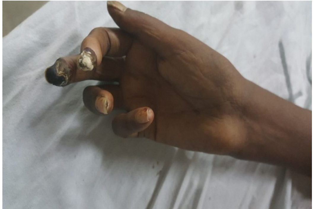
FIGURE 1: Acral ulcers

finger that gradually increased and later her left ring finger was also involved. Her left index finger underwent autoamputation after two months of the development of the discoloration as showed in Figure 1. Four months back she developed similar complaints in her right index and middle fingers. She has a history of blue discoloration of her fingers on exposure to water for last two years. It was associated with cold sensation and numbness. Her fingers became red and tender after warming.