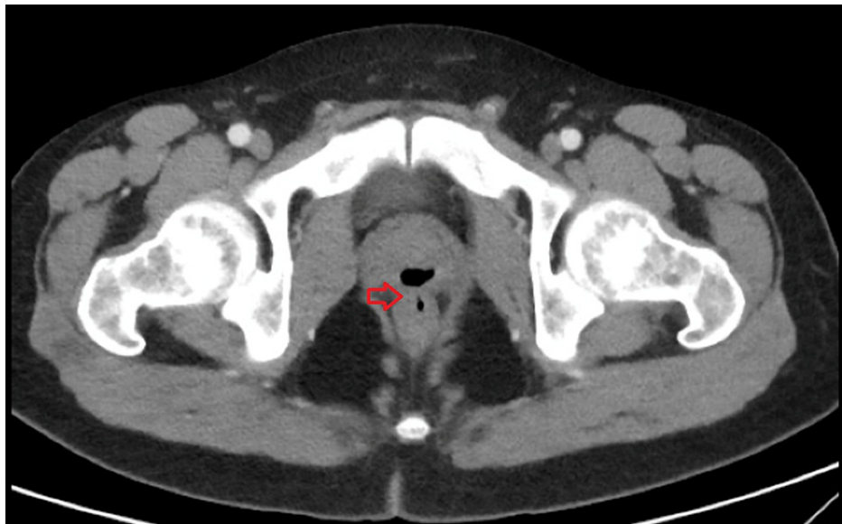
FIGURE 1: CT demonstrating gas-filled structure within the posterior aspect of the prostate communicating with the adjacent rectum.