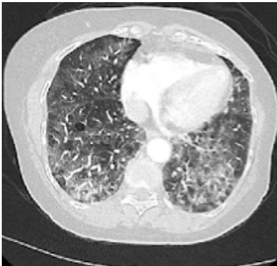
FIGURE 1: CT angiogram of the chest showing advanced centrilobular emphysema with nonspecific thickening of the pulmonary septa and associated ground-glass opacity predominating the mid to lower lung field.

In less than 24 hours of discharge, the patient presented to the emergency department complaining of severe right foot pain and cramping that started two hours prior. She also reported chest tightness and shortness of breath. The sharp/shooting pain was severe enough in nature that it would limit ambulation. Her SpO 2 on room air was 84% but improved to 94% when placed on OptiFlow with a flow rate of 50 liters and FiO 2 of 70%. Otherwise vitally stable and examination was unremarkable. Her blood work is illustrated in Table 1.