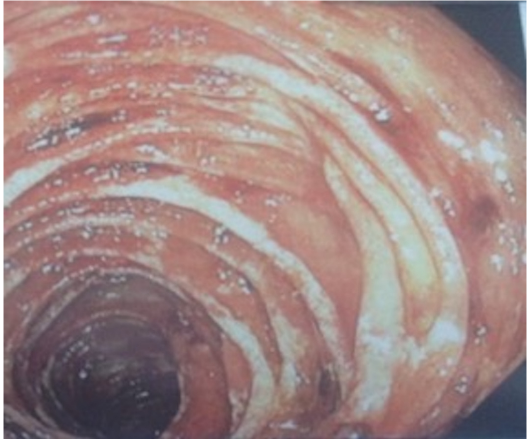
FIGURE 1: Small Bowel Endoscopy

mmHg. Right heart catheterization showed mild pulmonary hypertension. The severity of ascites could not be explained by mild pulmonary hypertension. Upper gastrointestinal (GI) endoscopy and colonoscopy were normal. Therefore, no biopsies were performed. He had recurrent ascites that was managed periodically with therapeutic paracentesis and diuretics. After eight weeks, the patient became severely malnourished and he was started on total parenteral nutrition. As recurrent ascites could not be explained by mild pulmonary hypertension, a liver biopsy was performed. The liver biopsy was normal. Enteroscopy showed the erythematous, edematous duodenum and jejunum (Figure 1).