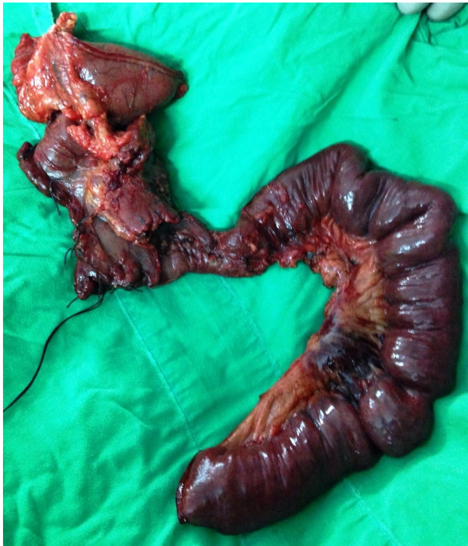
FIGURE 2: Whipple's pancreatoduodenectomy specimen showing large non-reconstructable duodenal injury

As the duodenum was not healthy enough to take suture for anastomosis even after freshening of the perforation edges and the small bowel was completely healthy consequent to contamination being limited to the retroperitoneum, Whipple's pancreatoduodenectomy was considered the most feasible option. The involvement of a trained hepatopancreatobiliary surgeon in the case made this decision easier. The procedure was performed in standard manner with pancreatojejunostomy being constructed in an end-to-end invaginated fashion.