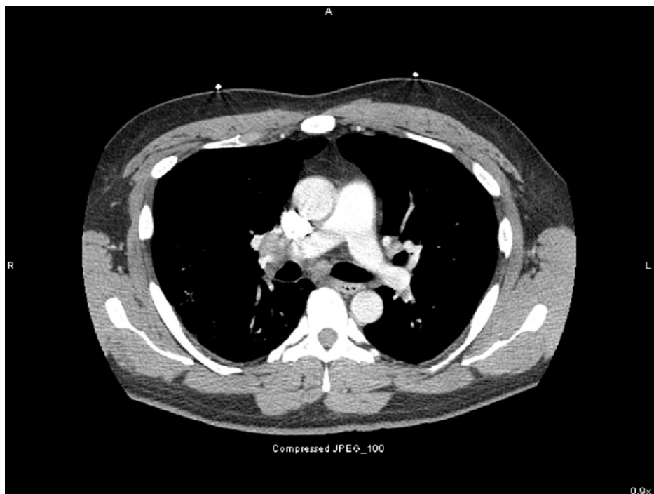
FIGURE 2: CT of the chest with subcarinal lymph node enlargement.