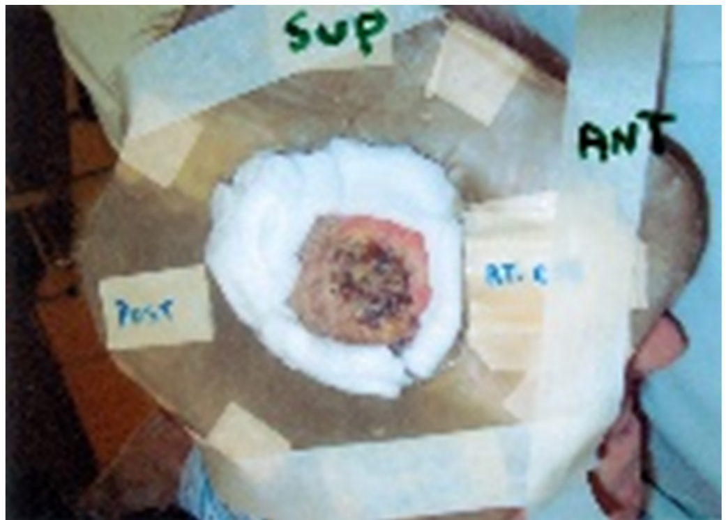
FIGURE 2: Customized Lead Shielding for Patient Treatment, Including Right External Eye Lead Shield.

The patient was reviewed at a multidisciplinary tumor board. Given the relatively large nature of this unusual tumor, an immediate surgical intervention was not felt to be in keeping with optimal management. Given his advanced age and medical comorbidities, he was deemed to be high-risk for a general anesthetic, and the broad, thick lesion with margins would have necessitated a larger resection with skin graft reconstruction. The location of the temporal branch of the facial nerve would have necessitated a limited deep margin resection. The patient was consented for radiotherapy totaling 4,500 cGy over three weeks of 9 MeV electrons with a margin of 2 cm. A bolus of 1.5 cm was used to ensure a 95 – 100% dose to the lesion. Customized lead shielding was used to minimize radiation to healthy tissue (Figure 2). Surgical reassessment and potential excision could then be arranged for a smaller resection, if needed.