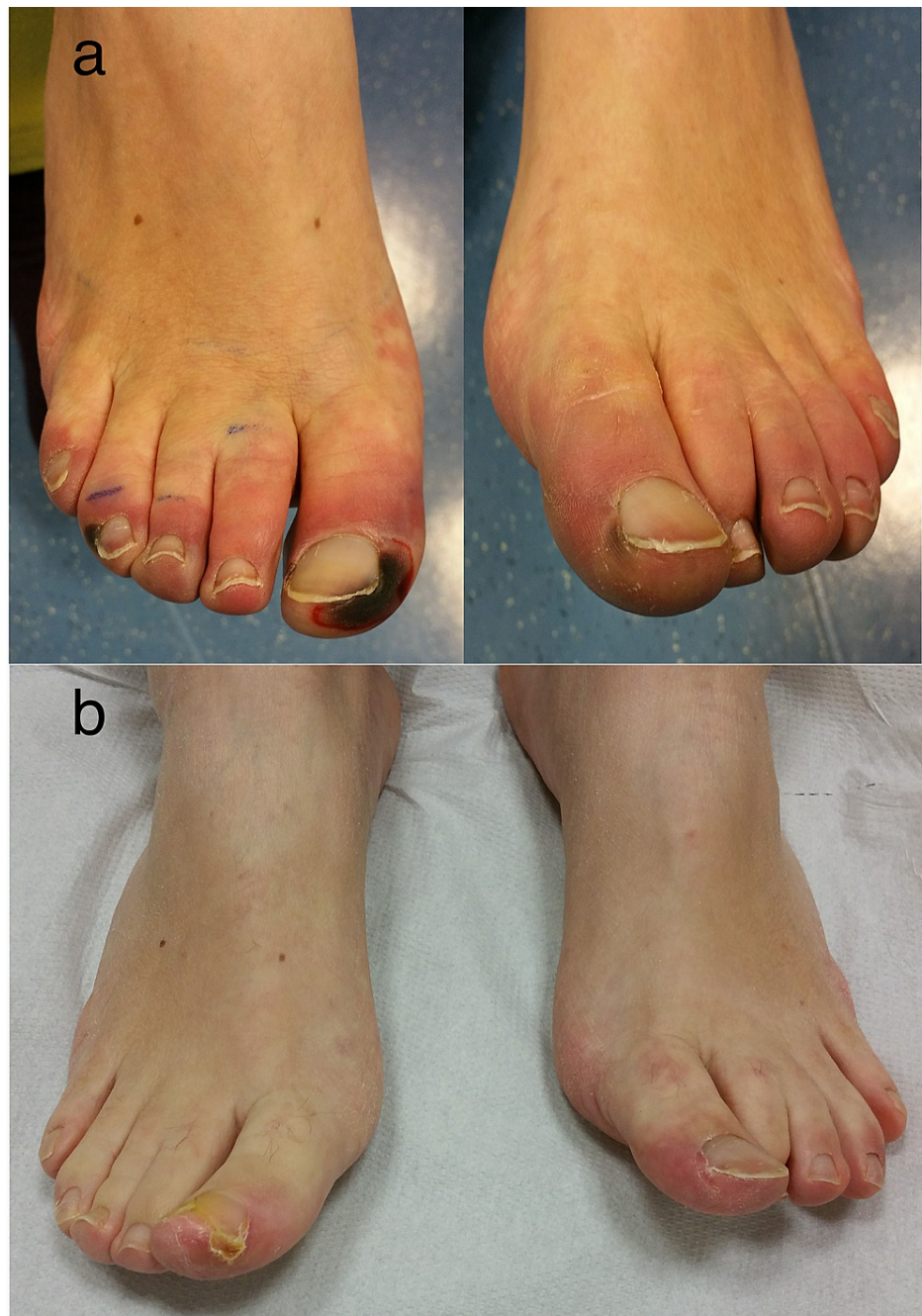
FIGURE 1: (a) Signs of incoming ischemia and necrotic ulcers of toes at admission in 2016, when diagnosis of necrotizing Raynaud's phenomenon was made. (b) Complete remission of ulcers at two months, after spinal cord stimulator implant