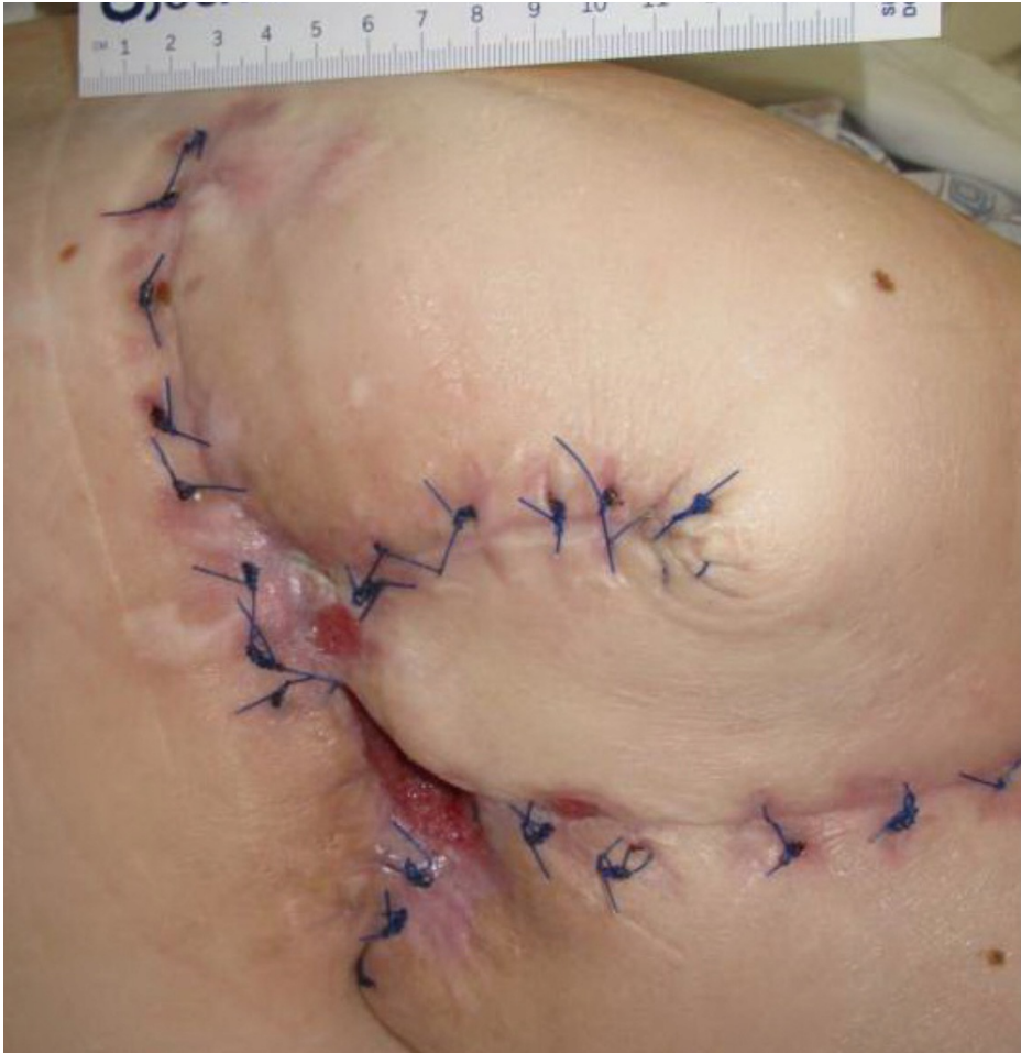
FIGURE 4: Day 29

3.8 cm x 3.2 cm x 5.0 cm (Length x Width x Depth)