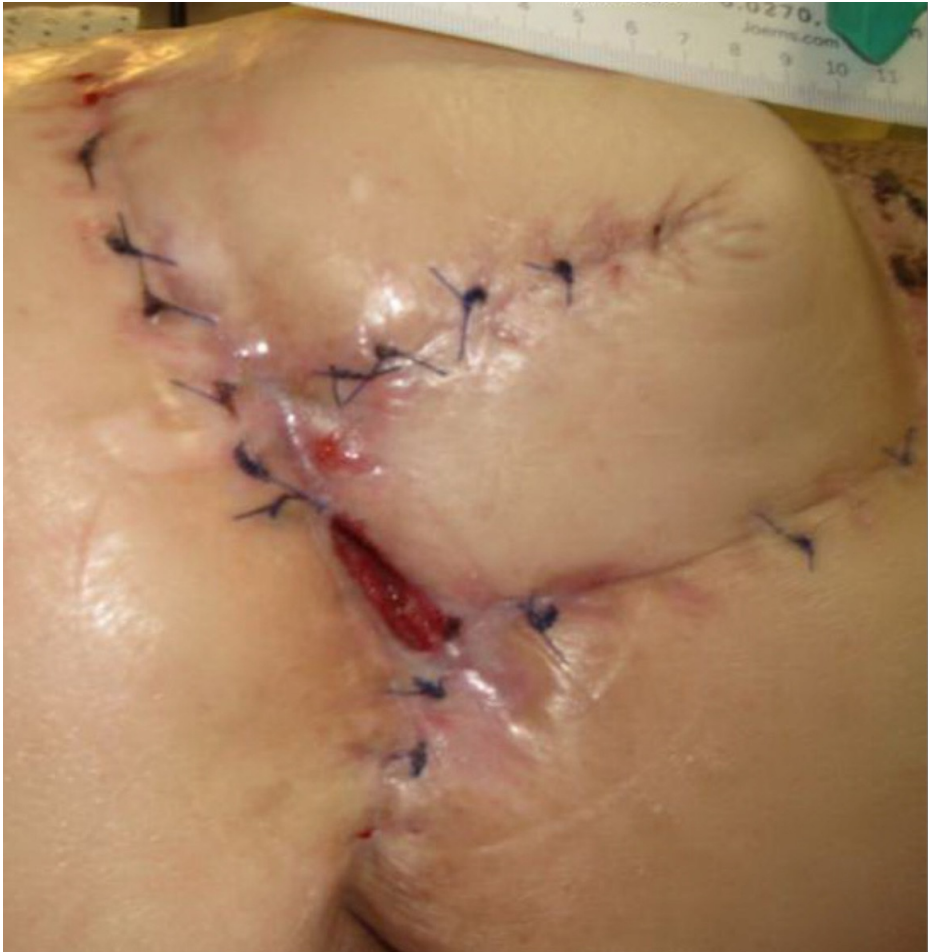
FIGURE 6: Day 50

0.6 cm x 2.7 cm x 0.7 cm (Length x Width x Depth)