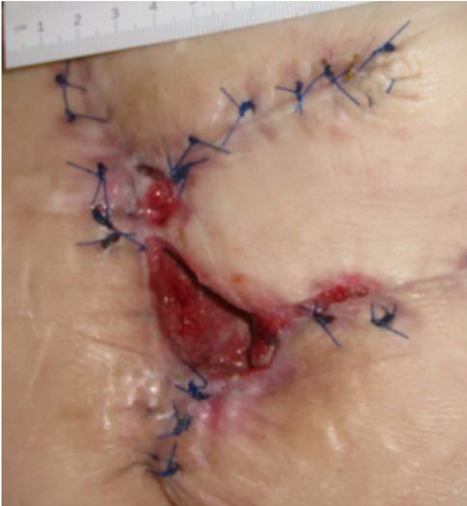
FIGURE 3: Day 15

4.0 cm x 3.5 cm x 6.5 cm (Length x Width x Depth)