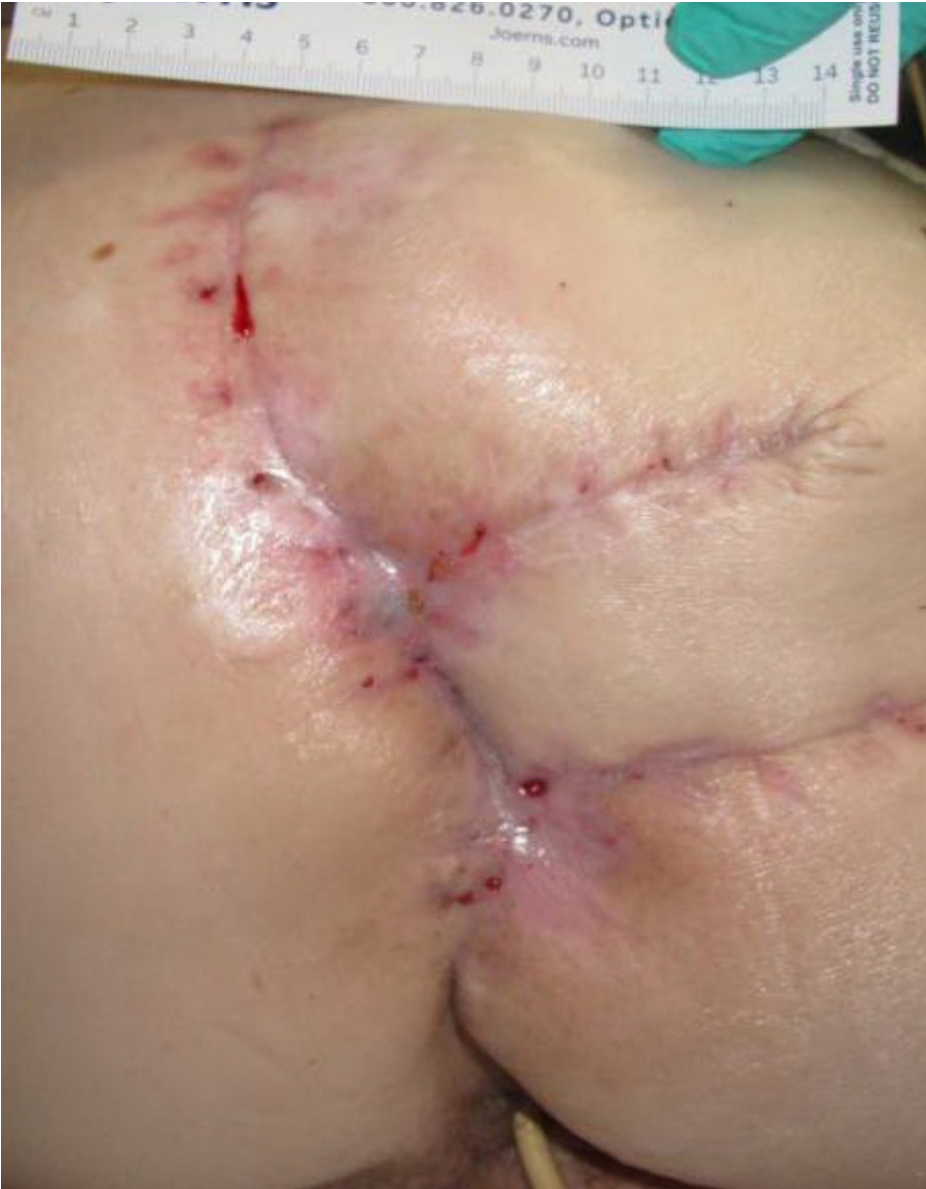
FIGURE 8: Day 64