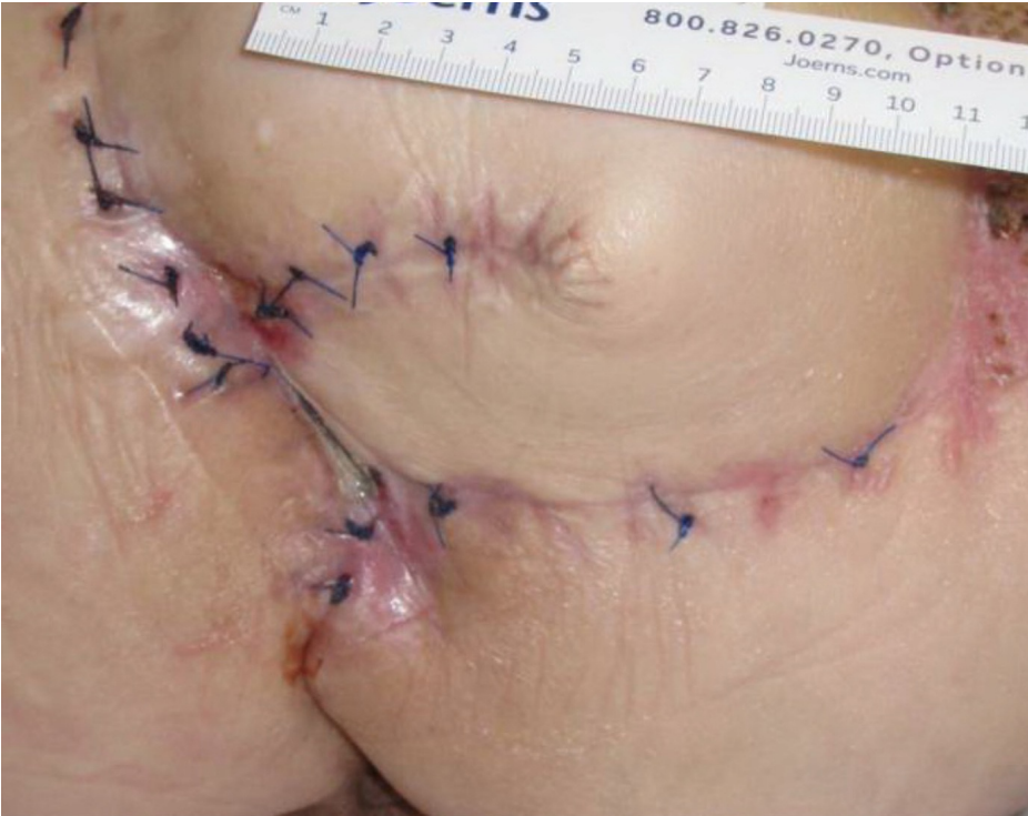
FIGURE 7: Day 57

0.5 cm x 0.2 cm x 0.0 cm (Length x Width x Depth)