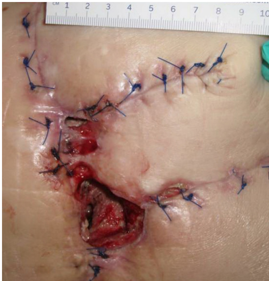
FIGURE 1: Day 1

The patient presented with a Stage IV trochanteric pressure ulcer with exposed bone and associated highly complex labyrinthine internal structure of undermining and deep tunneling. With the inherent complex structure of the wound combined with her refusal of recommended continued operative treatment, NPWTi-d represented an appropriate alternative option to deliver adjunctive therapy to the wound bed. Once NPWTi-d was applied, there was a progressive decrease in wound dimension (Figures 1-9). Some variability in obtaining consistent wound measurements may be related to patient positioning and the complex three-dimensional structure of the wound. This likely explains the initial increase in wound volume measured.