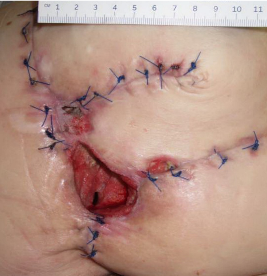
FIGURE 2: Day 8

4.0 cm x 3.8 cm x 4.7 cm (Length x Width x Depth)