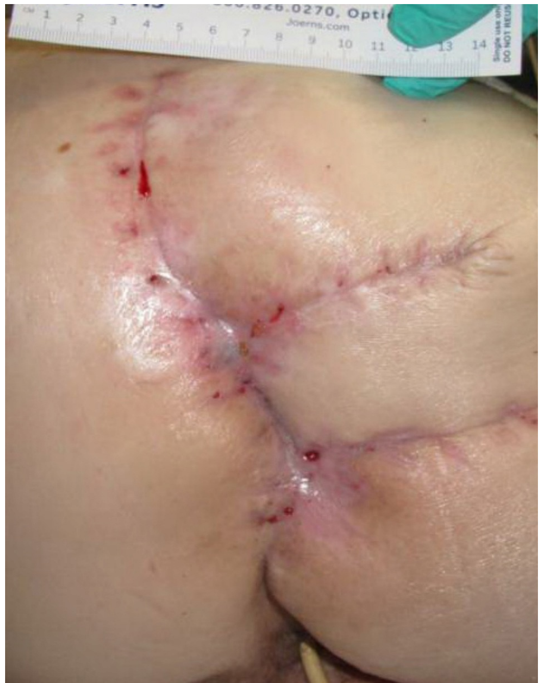
FIGURE 8: Day 64