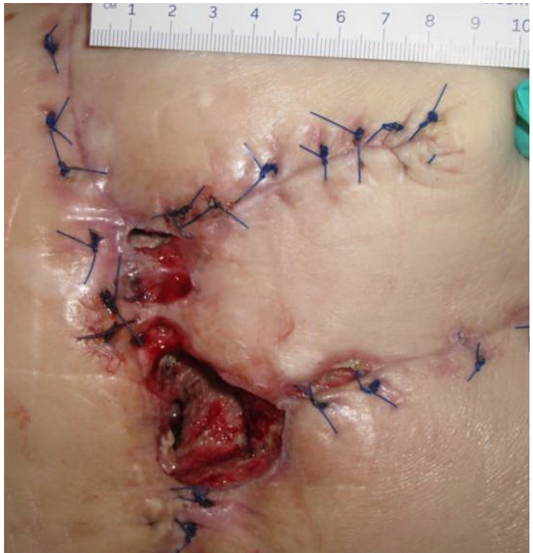
FIGURE 1: Day 1

3 cm x 1.5 cm x 7.5 cm (Length x Width x Depth)