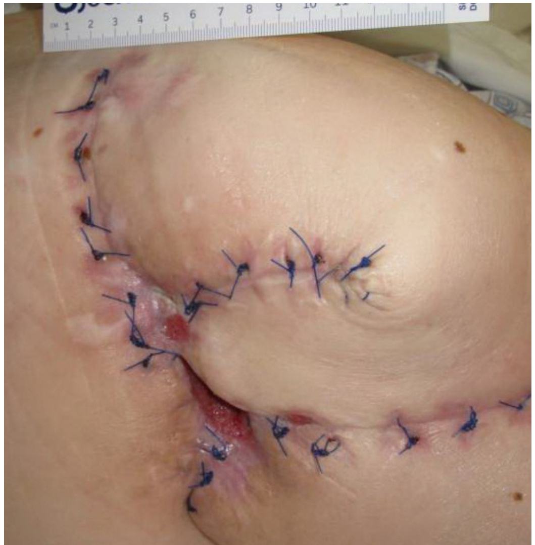
FIGURE 4: Day 29

3.8 cm x 3.2 cm x 5.0 cm (Length x Width x Depth)