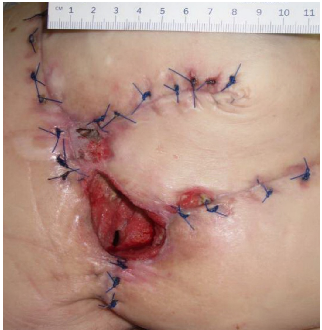
FIGURE 2: Day 8

4.0 cm x 3.8 cm x 4.7 cm (Length x Width x Depth)