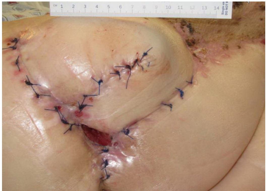
FIGURE 5: Day 43

2.2 cm x 3.0 cm x 2.5 cm (Length x Width x Depth)