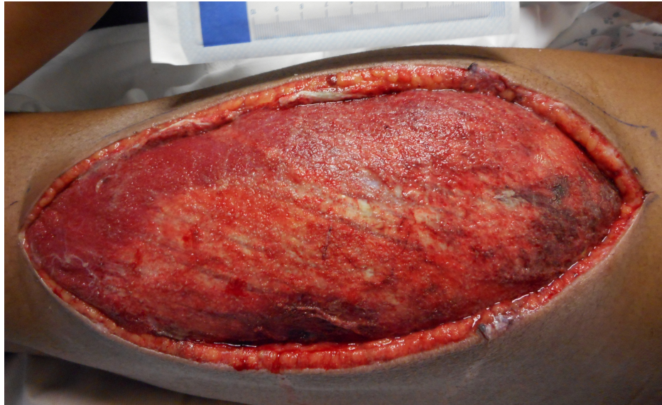
FIGURE 1: Compartment Syndrome

10 cm x 27 cm lateral lower extremity fasciotomy after the development of compartment syndrome.