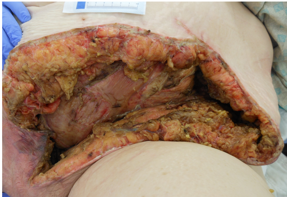
FIGURE 2: Necrotizing Fasciitis Before the Second Operative Debridement