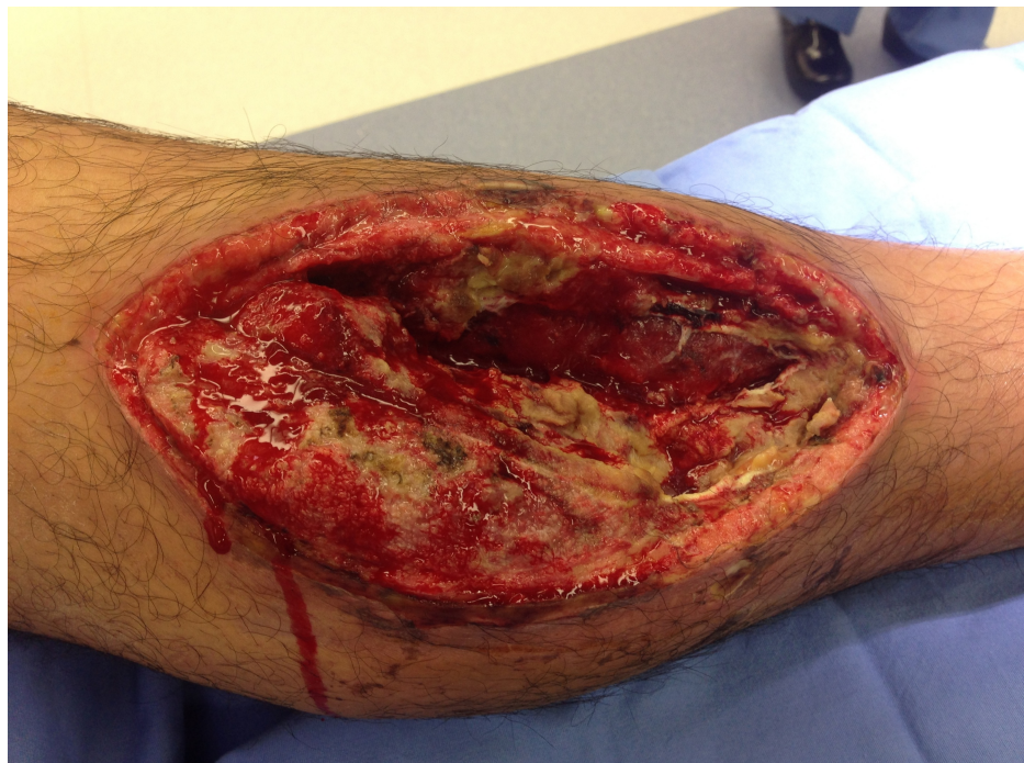
FIGURE 7: Before Dakin's NPWTi-d

Goss et al., tested quarter strength Dakin's and its efficacy on chronic leg wounds. With their instillation time of 10 minutes followed by 1 hour of NPWT, they were able to show a reduction in colony-forming units (CFU) per gram of tissue culture when compared to NPWT alone. Their results were not statistically significant, and both groups underwent this therapy after sharp debridement; however, they were able to show an overall increase in CFUs in the NPWT group and a decrease in CFUs in the NPWTi-d group. This therapy was continued for a total of 7 days [3]. As noted above, we have begun to use quarter-strength Dakin's solutions in all patients with necrotizing soft tissue infections or grossly contaminated wounds. Figure 7 depicts a medial lower extremity wound colonized with Enterococcus faecalis , Enterobacter sakazakii , Eikenella corrodens , and Haemophilus species.