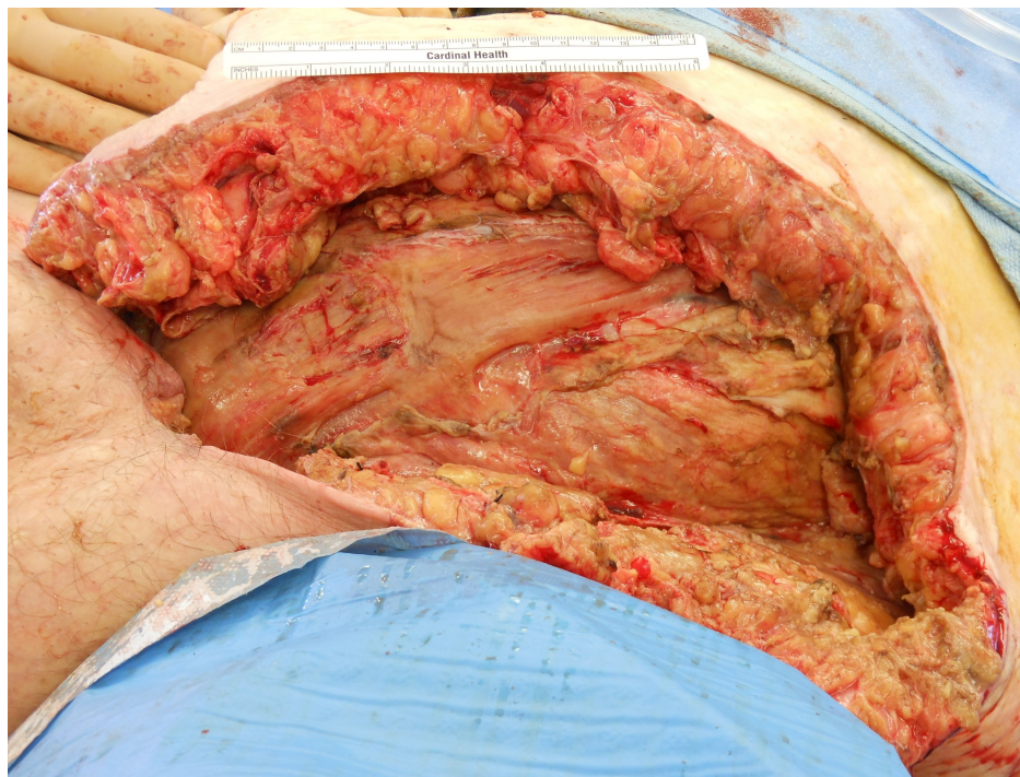
FIGURE 3: Necrotizing Fasciitis Post-Debridement

Postoperative day 6, she returned to the operating room for a third and final time for delayed primary closure of the entire complex wound. Prevena TM Incisional Management System by Acelity and two Blake drains were used to contain the drainage at the closure site.