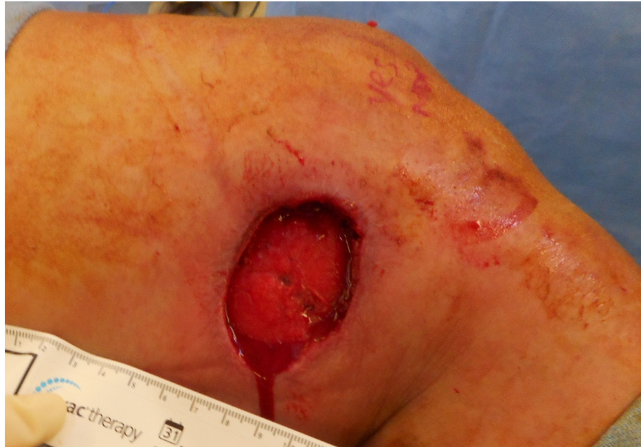
FIGURE 4: Postoperative Day 2

On postoperative day 2, she returned to the operating room for a washout of the 4 x 5.5 cm opening and 10 x 20 cm extending underneath into the subcutaneous pre-fascial space as noted in Figure 4 below. Granulation was visualized without signs of infection. NPWTi-d was continued.