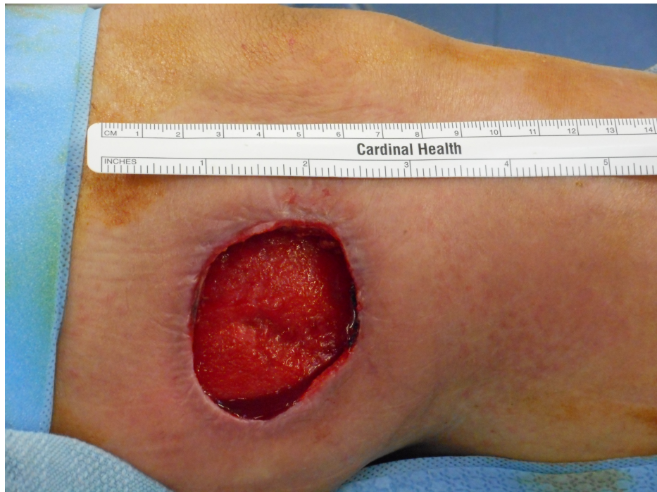
FIGURE 5: Postoperative Day 5

On postoperative day 9 in the operating room, the wound was washed out finding healthy granulation tissue without infection. The opening was 3.5 x 5 cm, yet now 5 x 6.5 cm extension into the subcutaneous space was noted. Although she could have then been managed as an outpatient as evidenced in Figure 6, her socioeconomic status delayed her initial discharge. NPWTi-d was taken advantage of until postoperative day 12 when she was converted to traditional NPWT for discharge home.