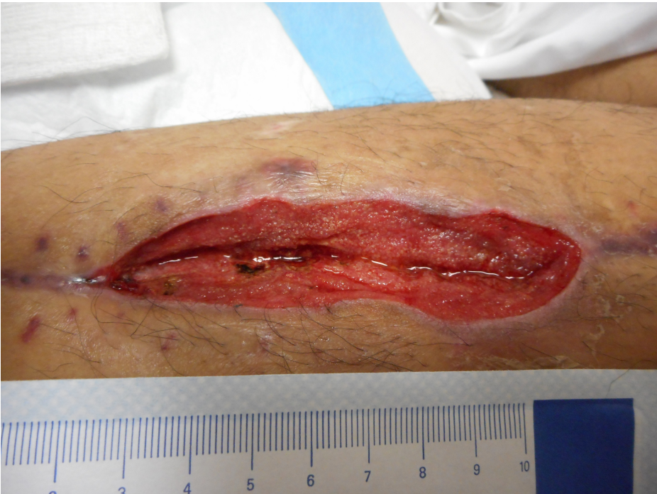
FIGURE 9: Week 8

NPWT continued for an additional 7 weeks with results shown in Figure 9, prior to delayed primary closure measuring 8 x 2 cm.