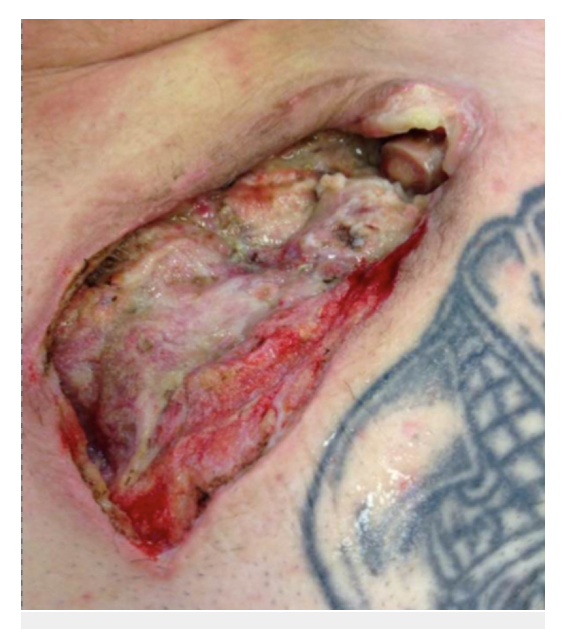
FIGURE 4: Wound on POD#8

Wednesday, Friday schedule for NPW VAC change with progressive wound contraction and granulation (Figures 4-7). His hospital course was complicated by acute and chronic pain and a peripherally inserted central catheter (PICC) line deep vein thrombosis (DVT) requiring management with Lovenox and Coumadin. He was eventually discharged on POD#30.