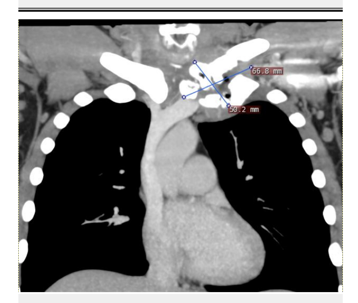
FIGURE 3: Coronal CT Chest

An axial CT of the chest with IV Contrast demonstrating destructive changes at the left SCJ and first costochondral junction with fluid collection and air measuring up to 6.5 cm consistent with septic joint and osteomyelitis.