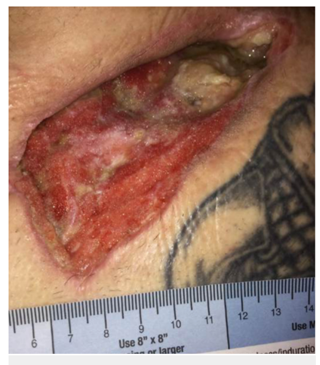
FIGURE 5: Wound on POD#15

Wound with decreased fibrinous tissue overlying wound base, >80% of wound base granulation, and progression in peripheral epithelialization.