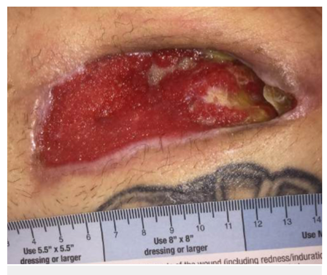
FIGURE 6: Wound on POD#38

Wound contraction with progressive epithelialization.