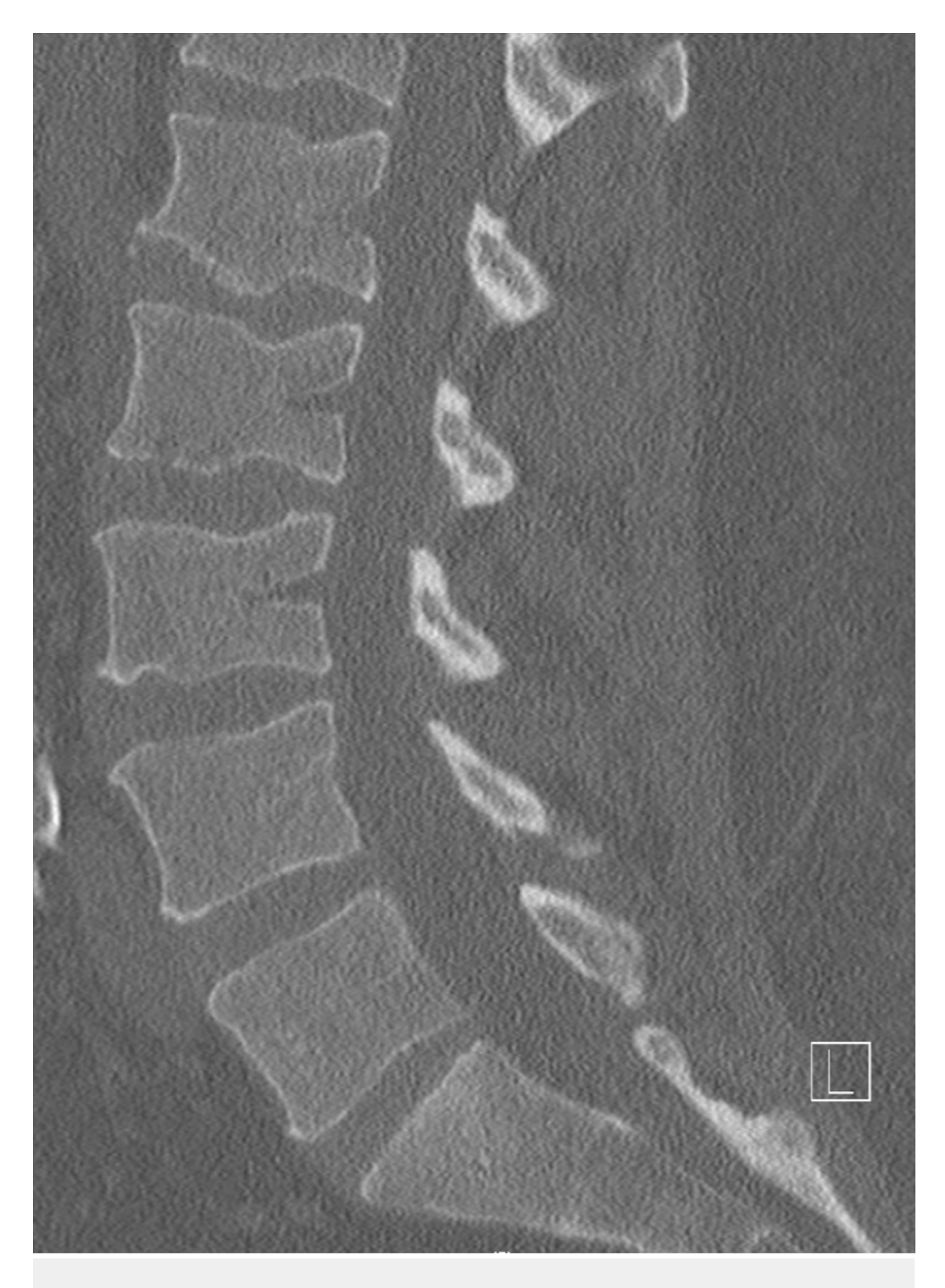
FIGURE 1: Initial CT revealing subtle irregularity of inferior endplate of L2.

Initial lumbar spine computed tomography (CT) obtained in the Emergency Department revealed a subtle irregularity of the L2 inferior endplate. Magnetic resonance imaging (MRI) of the lumbar spine again showed erosion of the L2 inferior endplate as well as diffuse L2 bone marrow edema, suggestive of either recent trauma or infection. MRI with contrast revealed small foci of enhancement of the L2 inferior endplate, as seen in Figures 1-3 .