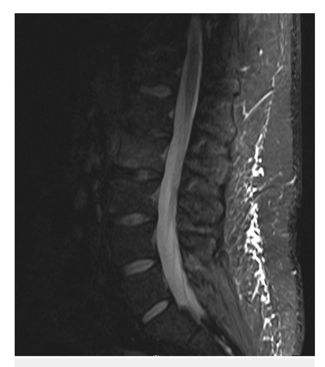
FIGURE 2: Initial MRI with contrast showing increased STIR signal change indicating diffuse bone marrow edema.