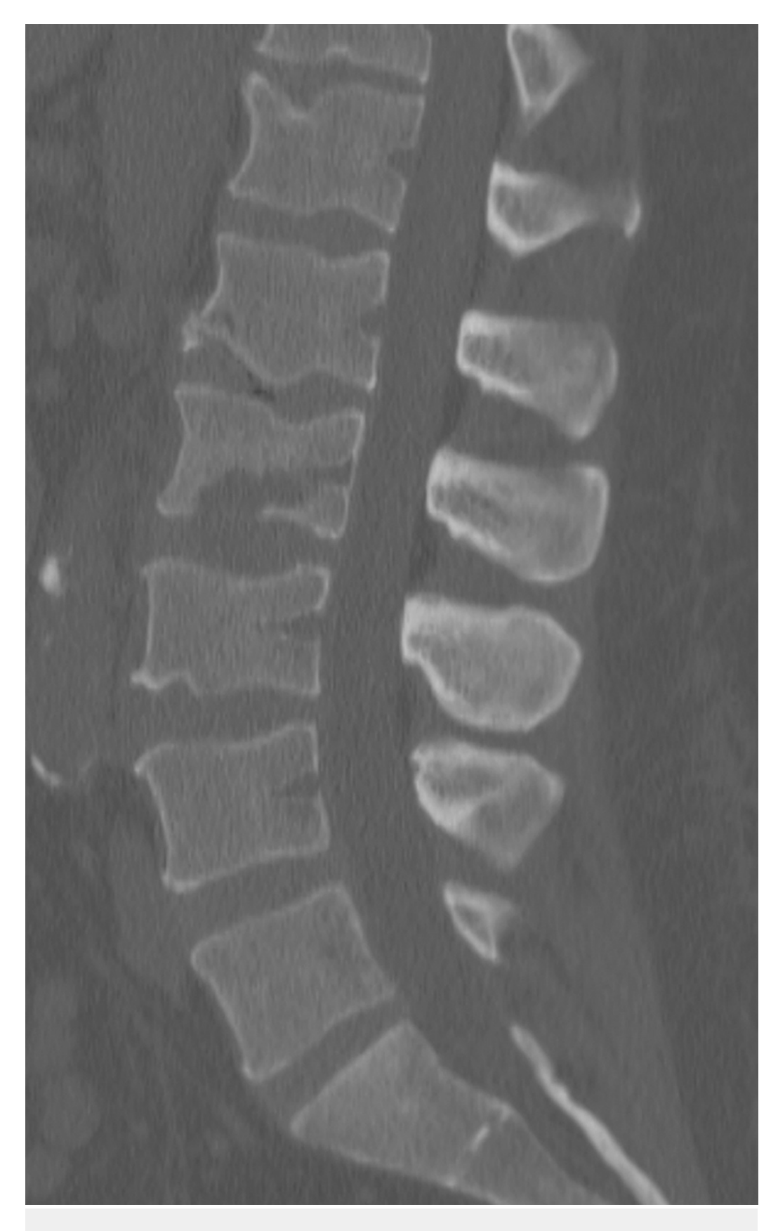
FIGURE 5: Follow-up CT demonstrating a significant progression of osseous destruction of the L2 vertebral body.