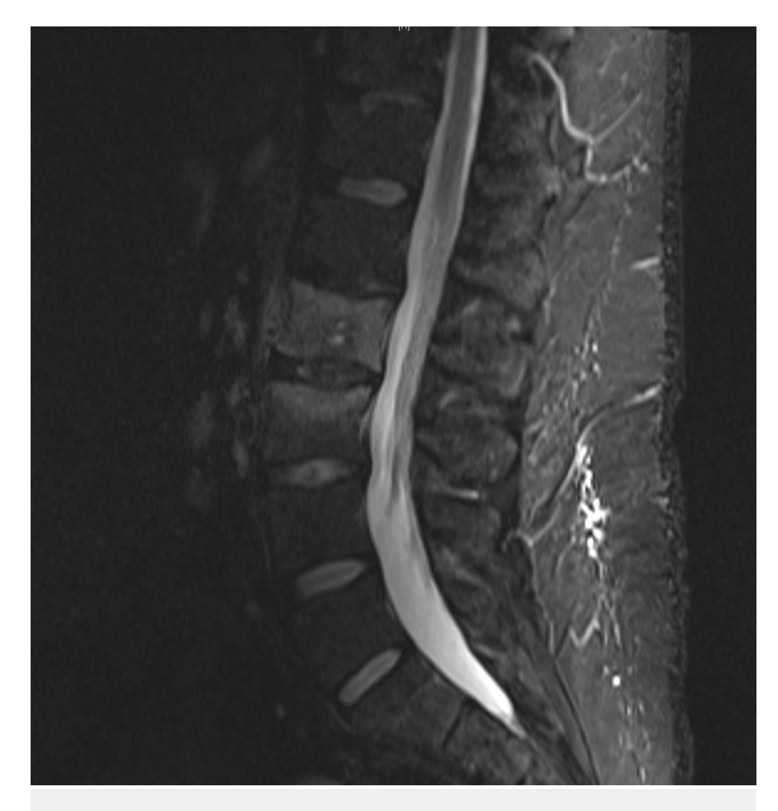
FIGURE 4: Follow-up MRI demonstrating increased signal change within the L2 vertebral body.