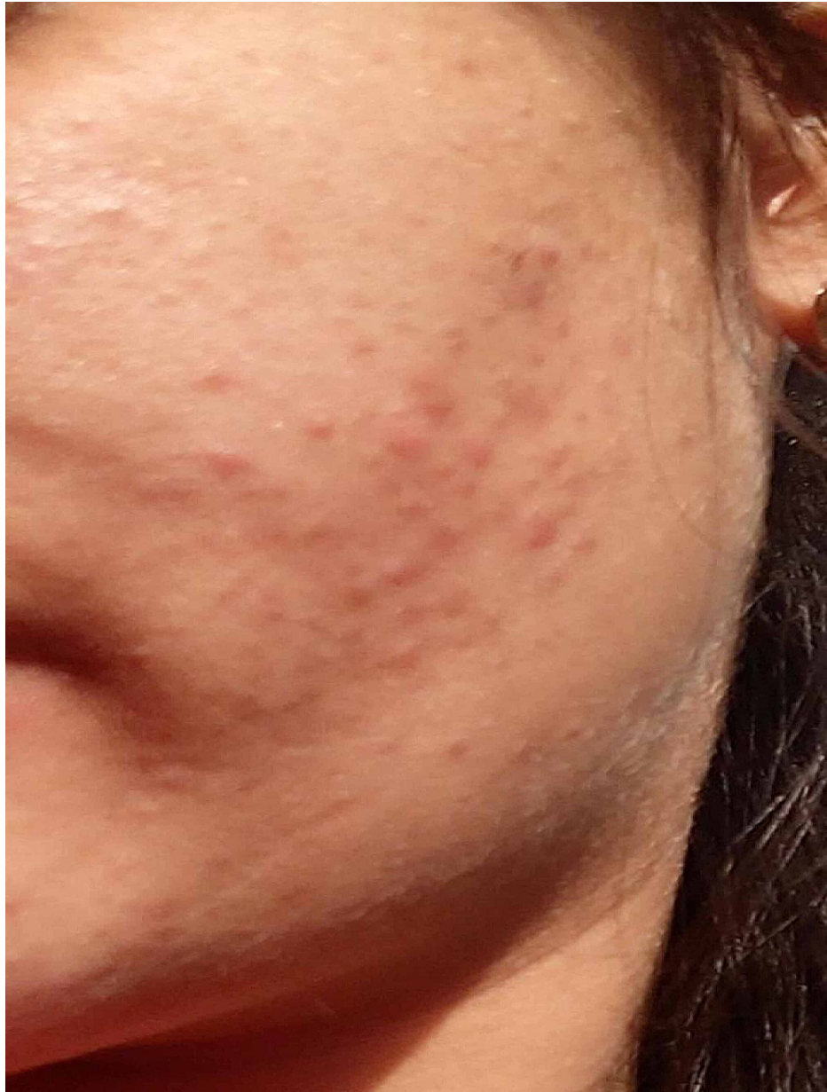
FIGURE 1: Erythematous papules on the left cheek with no complaints of itching, burning or pain on presentation

Small red papules can be noticed on the face with virtually no comedones. Some residual hyperpigmentation can also be noticed in the vicinity, possibly as sequelae of previously resolved acne.