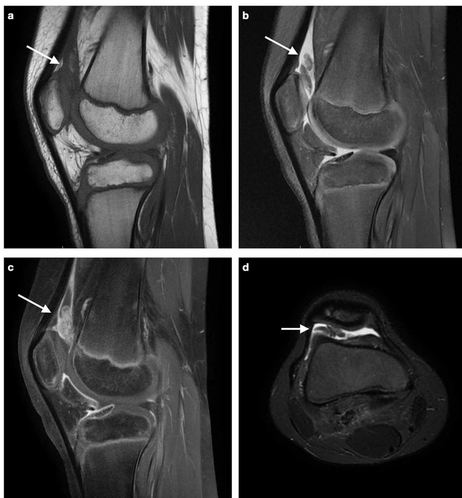
FIGURE 1: Magnetic Resonance Imaging of the right knee revealing extensive synovial proliferation, suggestive of pigmented villonodular synovitis (PVNS). Maximum amount of hypertrophic synovium in the suprapatellar pouch (arrow)

were unremarkable. Laboratory workup included a complete blood count (CBC), a basic metabolic panel, and serological markers for rheumatoid diseases and they were all within the normal range. An MRI of the right knee revealed joint effusion and extensive nodular synovial proliferation suggestive of PVNS (Figure 1).