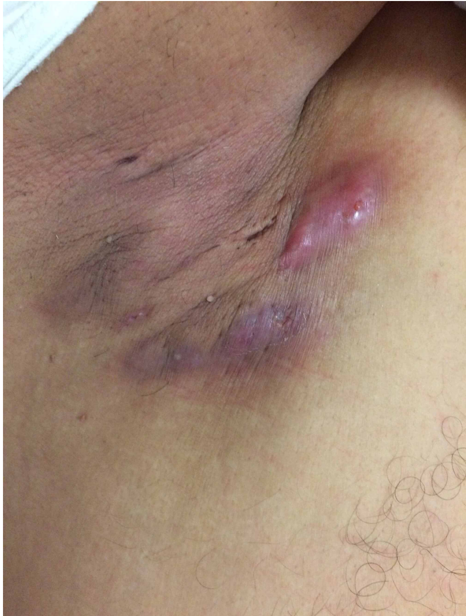
FIGURE 2: Erythematous skin lesions in axillary region