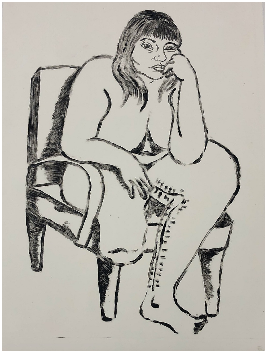
FIGURE 1: Self-portrait of ZS created during post-operative period