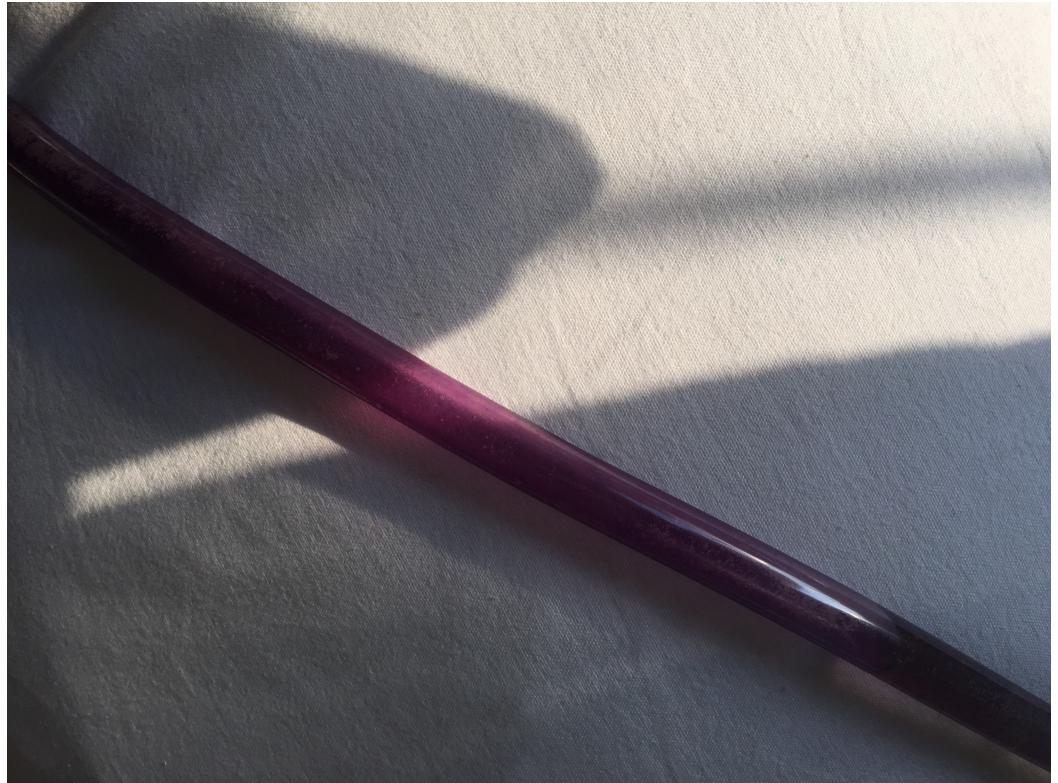
FIGURE 2: Purple urine in catheter tube.

Informed patient consent was obtained for treatment of this patient.