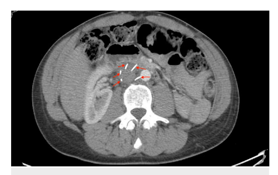
FIGURE 5: CT of the abdomen showing only five out of the six struts of the inferior vena cava filter with one strut missing.