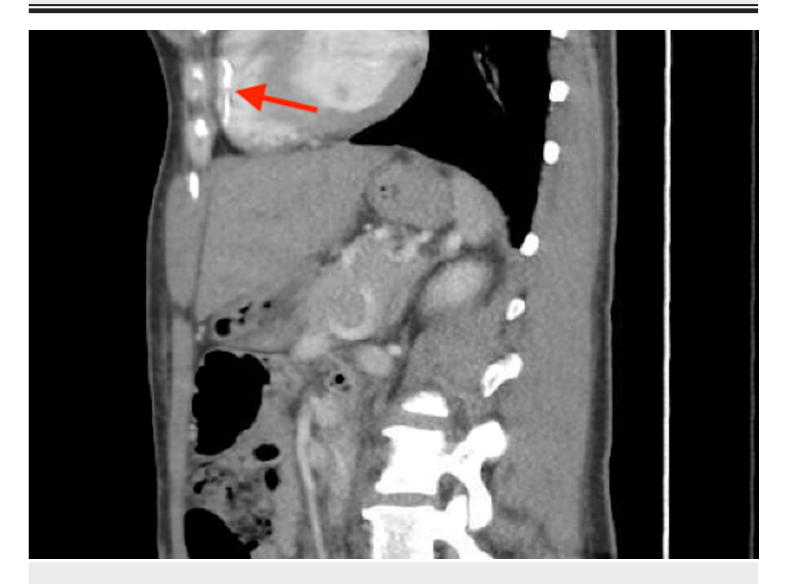
FIGURE 4: CT of the chest and abdomen (sagittal section) showing the migrated inferior vena cava filter strut (red arrow).

FIGURE 3: CT of the chest and abdomen (coronal section) showing the migrated inferior vena cava filter strut (red arrow).