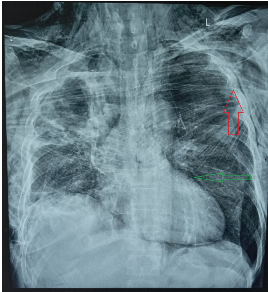
FIGURE 1: Ginkgo leaf sign (red arrow) suggestive of extensive subcutaneous emphysema and pneumomediastinum (green arrow).

subsequently developed worsening dyspnea. On examination, he was noted to have palpable subcutaneous crepitus over his upper body and mild soft tissue swelling. A chest X-ray demonstrated the “Ginkgo leaf sign” indicative of extensive subcutaneous emphysema and pneumomediastinum (Figure 1). Three intercostal tubes were inserted, two on the right side for decompression and one on the left side due to radiological evidence of subcutaneous air extending across the mediastinum and concern for early contralateral involvement and mediastinal shift.