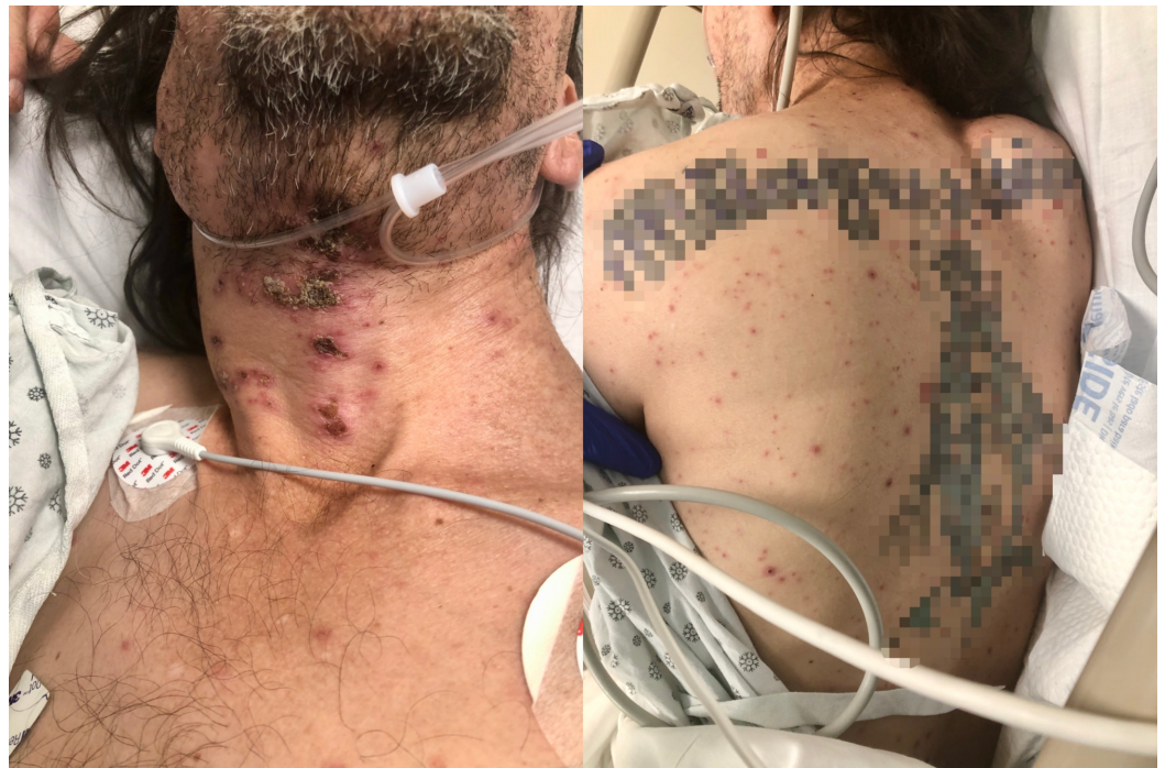
FIGURE 1: Vesicular-pustular rash in different stages of healing seen on the neck (left) and back (right).

emergency room. His initial vital signs showed a temperature of 100 °F, blood pressure of 143/91 mmHg, heart rate of 105 beats per minute, respiratory rate of 20 per minute. He was noticed to have disseminated, vesicular-pustular rash all over his body at different stages of healing and crusted skin eruption on his anterior neck and submandibular area (Figures 1-2).