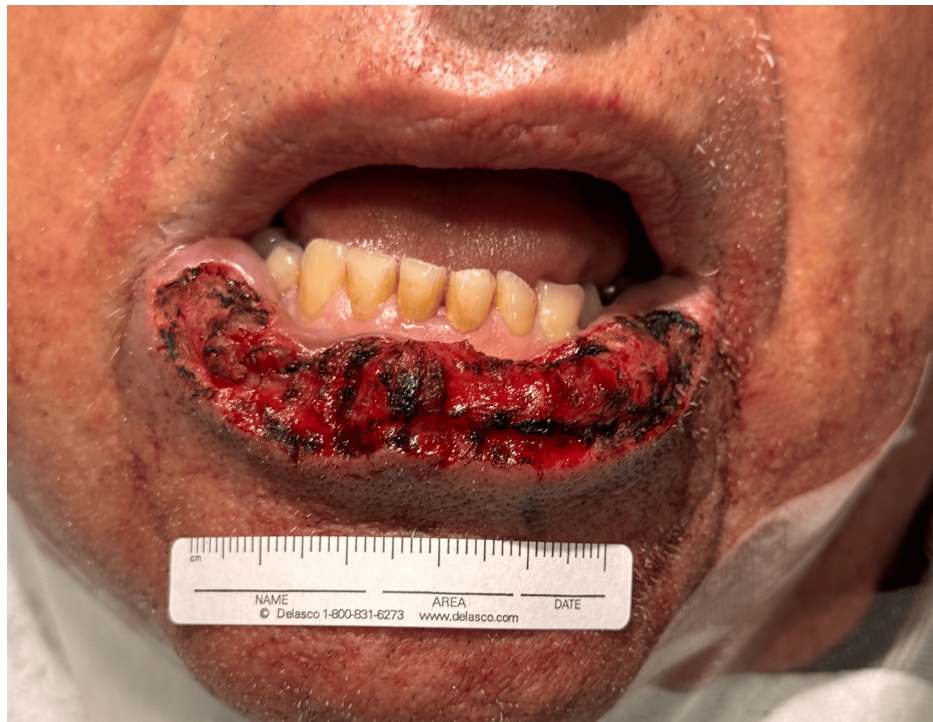
FIGURE 2: Surgical defect of the lower lip vermilion following tumor removal

MMS was completed in five stages, resulting in a final musculomucosal defect measuring 6.8 \times 1.7 cm (Figure 2), encompassing approximately 90% of the lower lip surface area. The defect was confined to the dry vermilion and adjacent oral mucosa. Following tumor removal and prior to final reconstruction, the patient demonstrated intact labial and perioral sensation and function. Histological findings were significant for full-thickness epithelial atypia with invasion into the dermis and submucosa and increased mitotic figures. These findings were consistent with a diagnosis of invasive Bowenoid SCC.