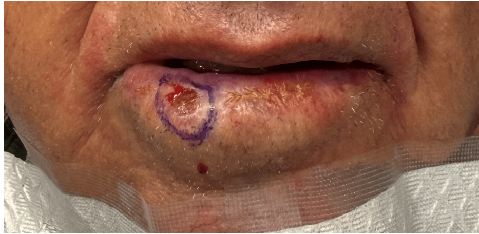
FIGURE 1: Clinical presentation of invasive Bowenoid SCC prior to Mohs surgery

The lesion is outlined with a surgical marking pen to delineate visible tumor margins prior to excision.