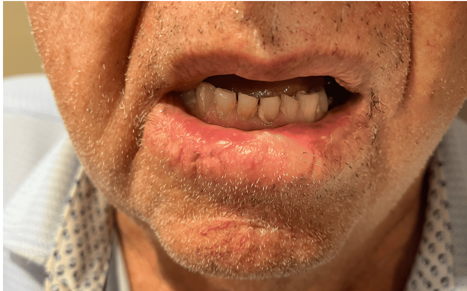
FIGURE 5: Postoperative result at six-month follow-up