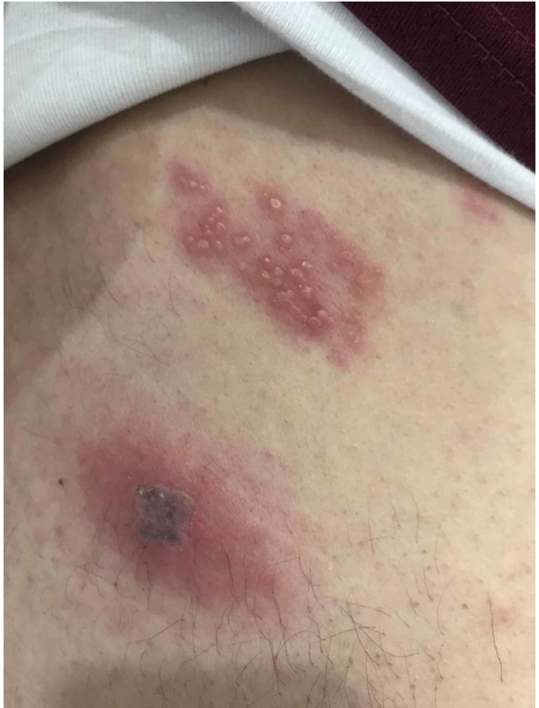
FIGURE 2: Vesicles on the tip of the right scapula with an area of scarring formed due to scratching, distribution is consistent with T4 dermatome.

Further, inspection revealed a similar rash on the tip of the right scapula with an area of scarring formed due to scratching the vesicles (Figure 2)..