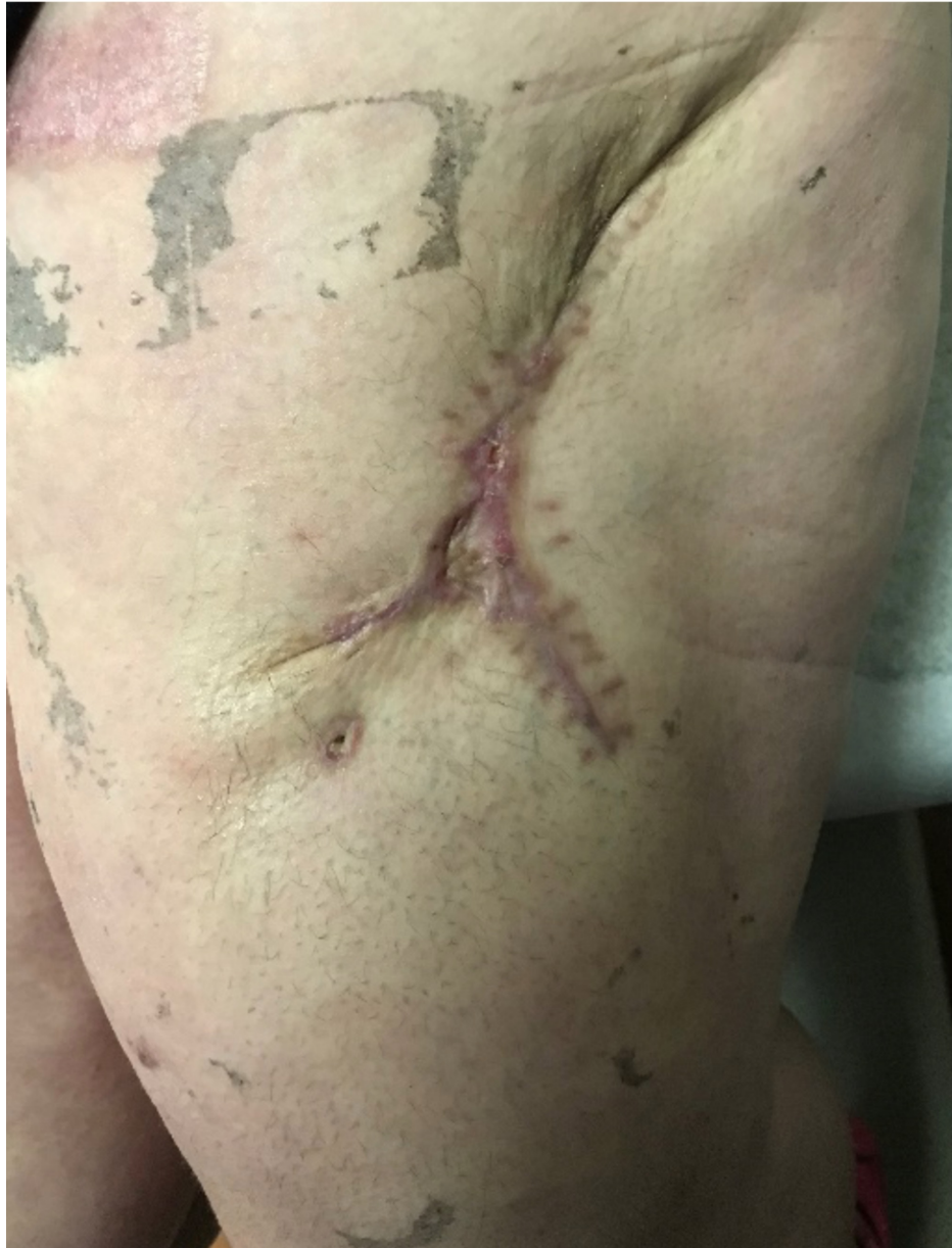
FIGURE 6: Wound at six weeks post-operatively