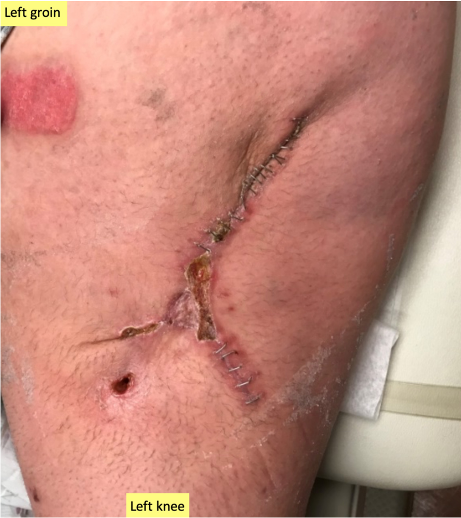
FIGURE 5: Wound at four weeks post-operatively

Wound edges are well-approximated, intact, and strengthened enough for staple removal; skin graft appears viable.