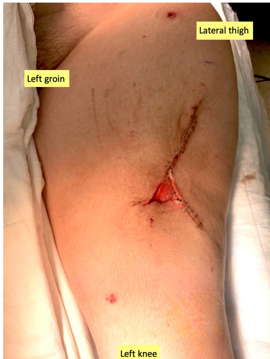
FIGURE 3: Pre-closure of the donor site with a STSG