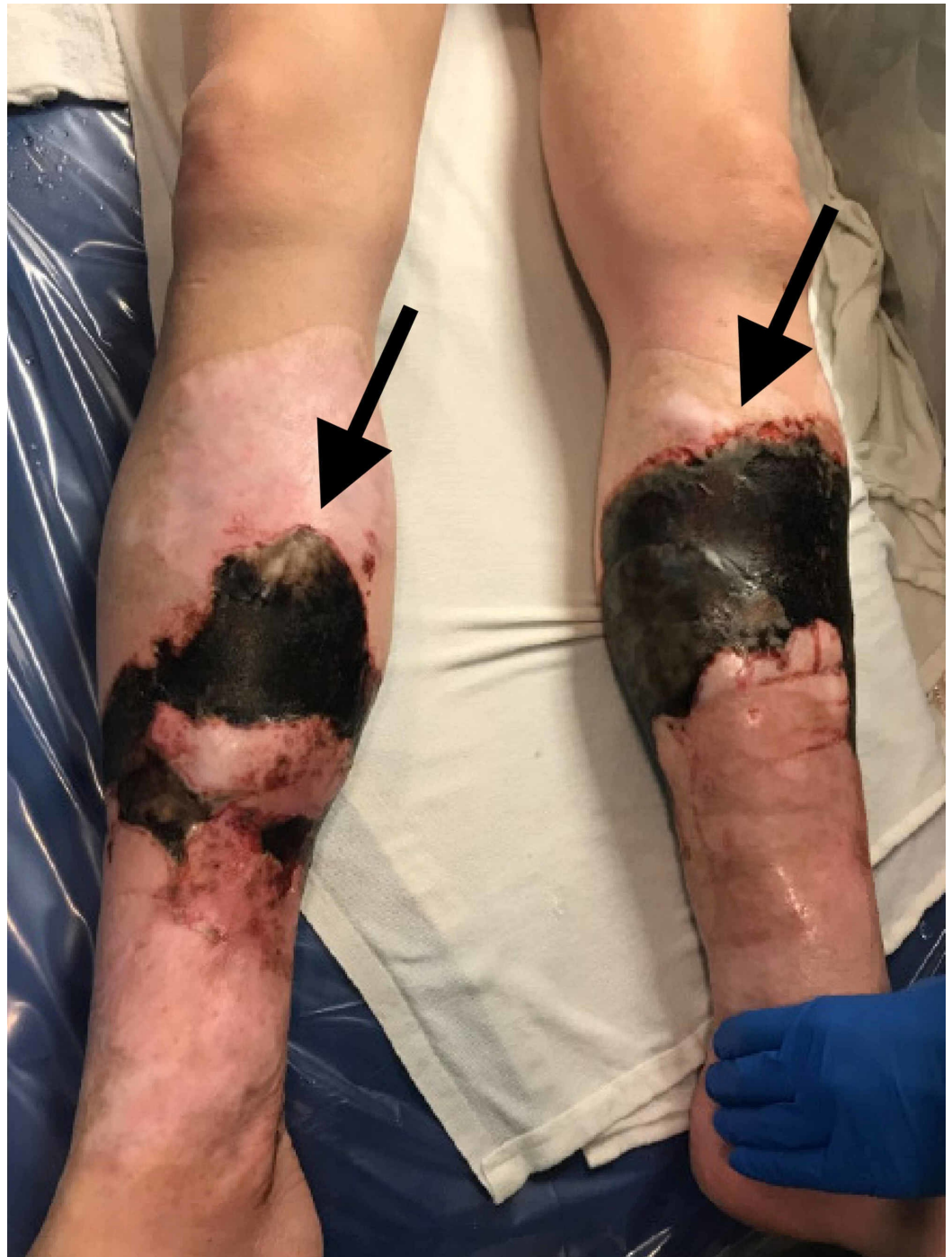
FIGURE 1: Lower legs showing black necrotic ulcer with well-defined raised erythematous borders.

Examination revealed discrete hypoesthetic eschar plaques on the bilateral lower distal extremities. Some plaques showed sharp well-demarcated borders and some with branching edges. No retiform purpura, palpable purpura, crepitus, or livedo was noted. Right lower extremity showed a background of atrophic shiny plaques coupled with scars at sites of reported prior PG lesions. She was afebrile with a leukocytosis of 20, C-reactive protein (CRP) of 80 (up from 23 during recent admission), and comprehensive metabolic panel (CMP) within normal limits.