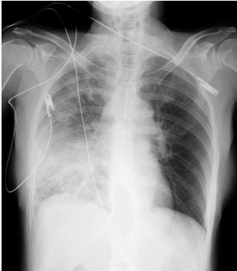
FIGURE 1: The chest radiograph obtained at the presentation.

Thoracic computed tomography (CT) revealed pneumonia in the right middle and lower lobe (Figures 1, 2). Blood tests revealed a white blood cell count of 6,200/ \mu L, which was within the normal reference range; however, C-reactive protein (CRP) was markedly elevated at 38.07 mg/dL. Additionally, lactate dehydrogenase (LD) and creatine kinase (CK) levels were elevated, accompanied by mild elevations in liver enzymes and mild renal impairment (Table 1). Sputum Gram staining revealed a Geckler classification of 5, with 3+ Gram-positive cocci, a small amount of Gram-negative cocci, and 3+ white blood cells. Additionally, a few instances of white blood cells phagocytosing Gram-positive cocci were observed.