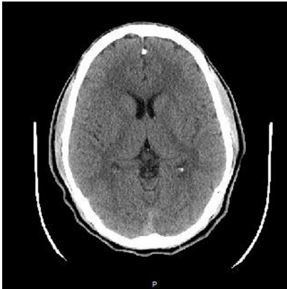
FIGURE 2: Head CT scan without contrast on admission showing no abnormal features.

We consulted with the pediatric neurology department and decided to admit the patient for observation. The electroencephalogram (EEG) was planned only if a patient had clinical deterioration. He was managed with levetiracetam 500 mg twice daily. During the in-ward hospital stay, the patient was stable and did not have seizures or other complaints. He was discharged the next day and scheduled for a follow-up in a week. During his follow-up, the patient looked fine and reported neither seizure nor any complaints in the preceding week.