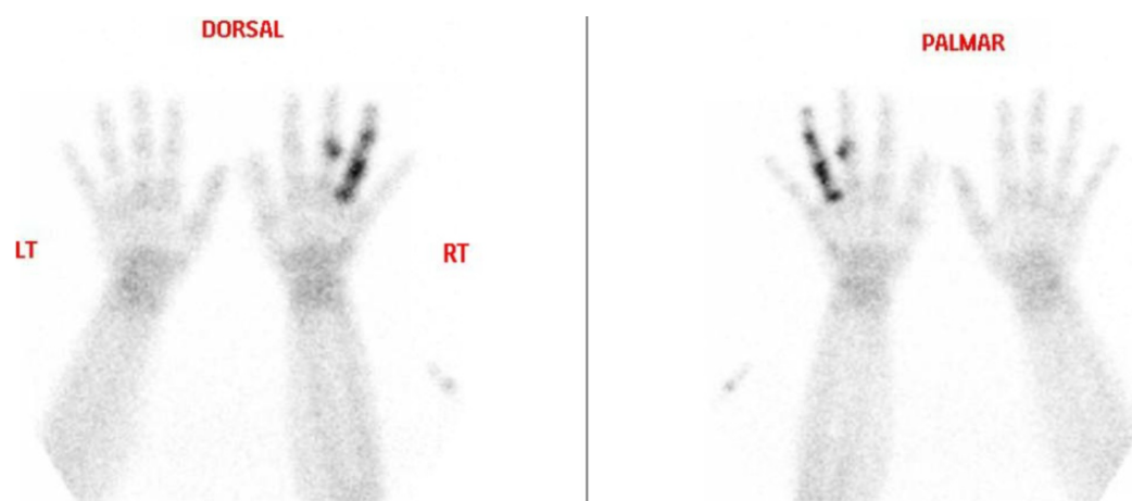
FIGURE 2: Bone scan of the hands.

An unenhanced CT scan of the right hand was obtained in control, axial, and sagittal reformats and demonstrated cortical and endosteal hyperostosis involving the proximal, middle, and distal third and fourth phalanges. It showed mild adjacent soft tissue bulge. However, the adjacent interphalangeal joints appeared unremarkable with no visible deformity. The above features were suggestive of the melorheostosis (Figure 3).