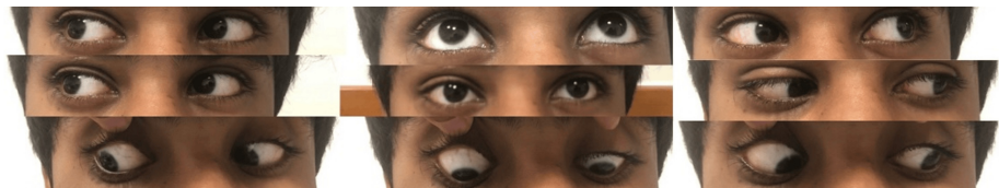
FIGURE 3: EOMs are full in all gazes with no ptosis or proptosis.

Treatment was started with oral prednisolone 40 mg/day with slow tapering doses for three weeks, and the patient was instructed to return if symptoms do not improve or exacerbate. He followed up on the 21st of January 2025 with a complete resolution of diplopia, ptosis, and proptosis. EOMs were full in all gazes (Figure 3). Both orthoptic examinations and Hess charting were well within normal limits. His visual acuity (VA) was also 20/20 in both eyes using the standard Snellen chart.