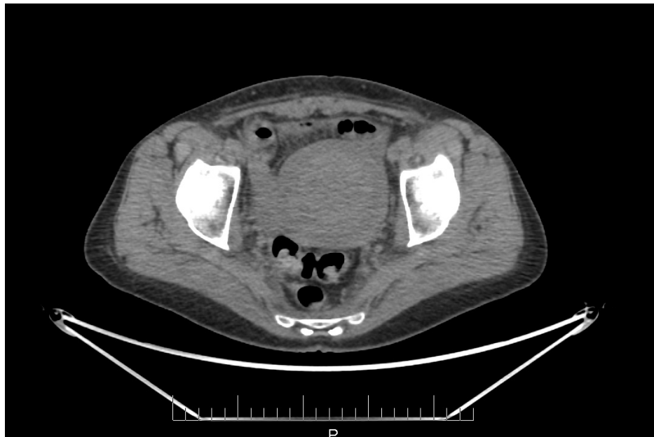
FIGURE 2: CT scan transverse image from the PET-CT showing normal thickness of the sigmoid, 3 months post-radiation

The CT scan specifically shows thickening of the sigmoid that was localised just posterior to the cervix and the uterus, corresponding to the high-dose region from brachytherapy (Figures 1, 3). The dosimetry from brachytherapy and pelvic irradiation were reviewed using the “worst case” hypothesis, assuming that the high-dose region from brachytherapy was the same for each fraction and that it also received the whole pelvic dose. Equivalent doses (EQD2) were used to calculate the minimum dose to the most irradiated 2 cm 3 of sigmoid (D2cc), as per GEC-ESTRO recommendations [17]. Using those parameters, the total sigmoid D2cc was 73 Gy, which is slightly higher than the GEC-ESTRO recommendation (sigmoid D2cc ≤ 70 Gy) but acceptable considering the close proximity of the sigmoid to the high-risk CTV. Radiation recall phenomenon has been associated with a wide range of radiation doses from 10 to 81 Gy and no threshold has been identified [15].