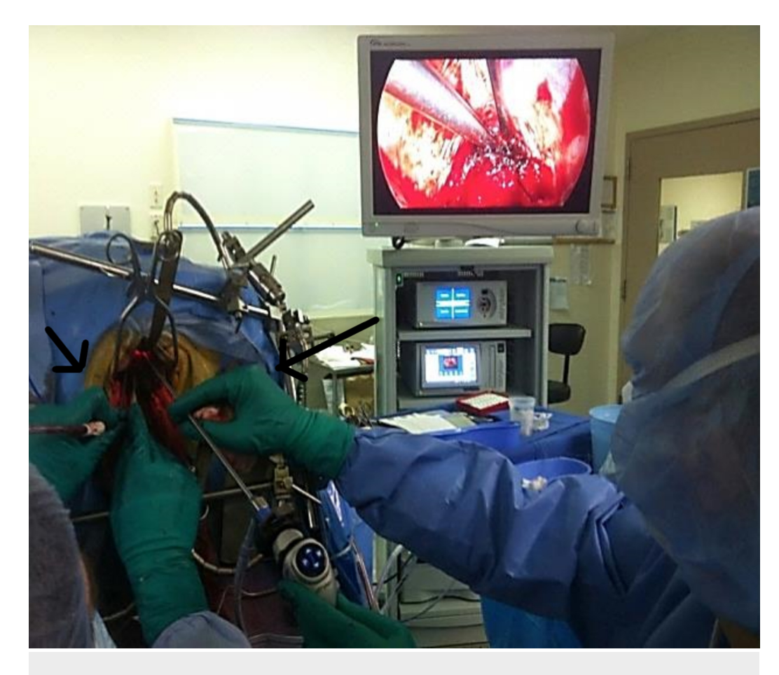
FIGURE 3: Dual operator approach to resection using endoscopy and laparoscopy.

The patient tolerated the procedure and underwent an uneventful postoperative course after which she was discharged to acute rehab on postoperative Day 5. Her ambulation improved to 300 feet with the assistance of her cane and her strength improved throughout. She complained of no visual disturbances and was discharged home after 10 days of rehabilitation. Postoperative CT and MRI (Figures 4, 5) showed a pseudomeningocele but the patient never developed a CSF leak, and it was managed expectantly. Pathologic examination of the tumor demonstrated moderately hypercellular, palisading spindle cells, with ill-defined whorl formations and a MIB1/Ki-67 proliferation index variable ranging up to 15%. Progesterone receptors were seen in approximately 50% of the tumor cell nuclei. A diagnosis of a World Health Organization (WHO) grade II meningioma was made based on these findings. The patient underwent radiation therapy for the small residual tumor and remained clinically stable without tumor growth at the six- and 12-month follow-ups. Her pseudomeningocele resolved without intervention.