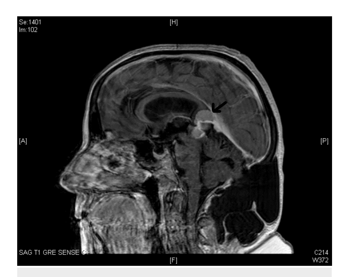
FIGURE 5: Postoperative MRI showing a small remnant tumor with pseudomeningocele