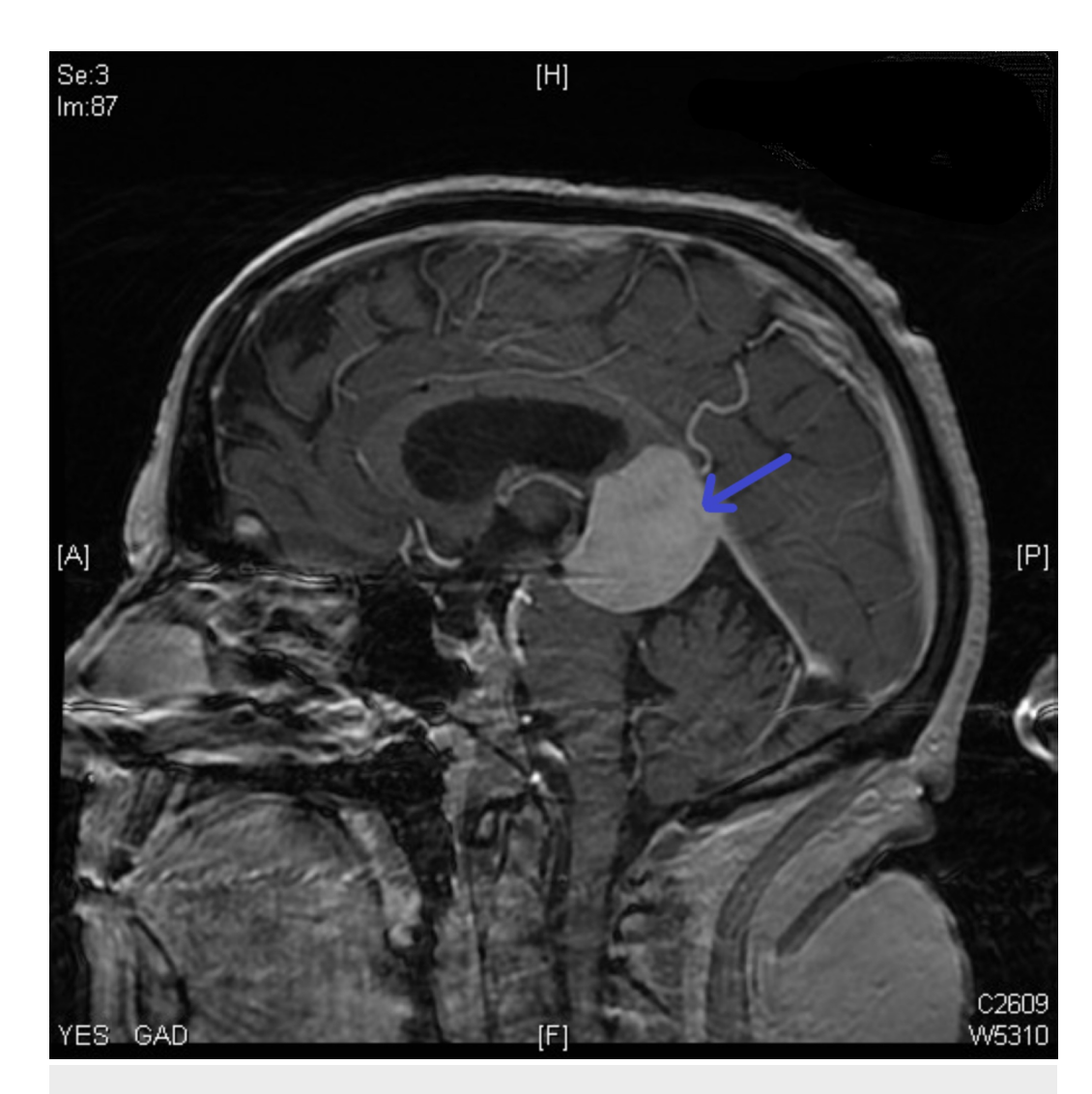
FIGURE 1: Preoperative MRI displaying the falcotentorial meningioma