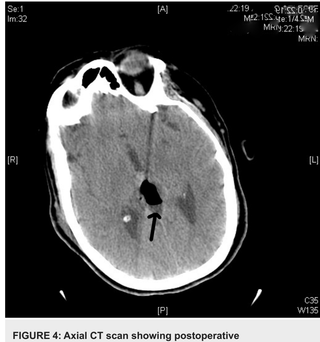
FIGURE 4: Axial CT scan showing postoperative pseudomeningocele