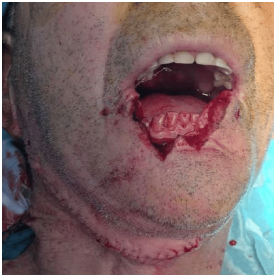
FIGURE 4: Defect resulting from tumor excision

The final histopathological report confirmed a moderately differentiated SCC, classified as pT2N0. The case was discussed in a multidisciplinary team meeting, and no further treatment was deemed necessary. A close follow-up was decided. During follow-up, the patient demonstrated optimal healing, with preserved function and satisfactory aesthetic results (Figure 5, Figure 6).