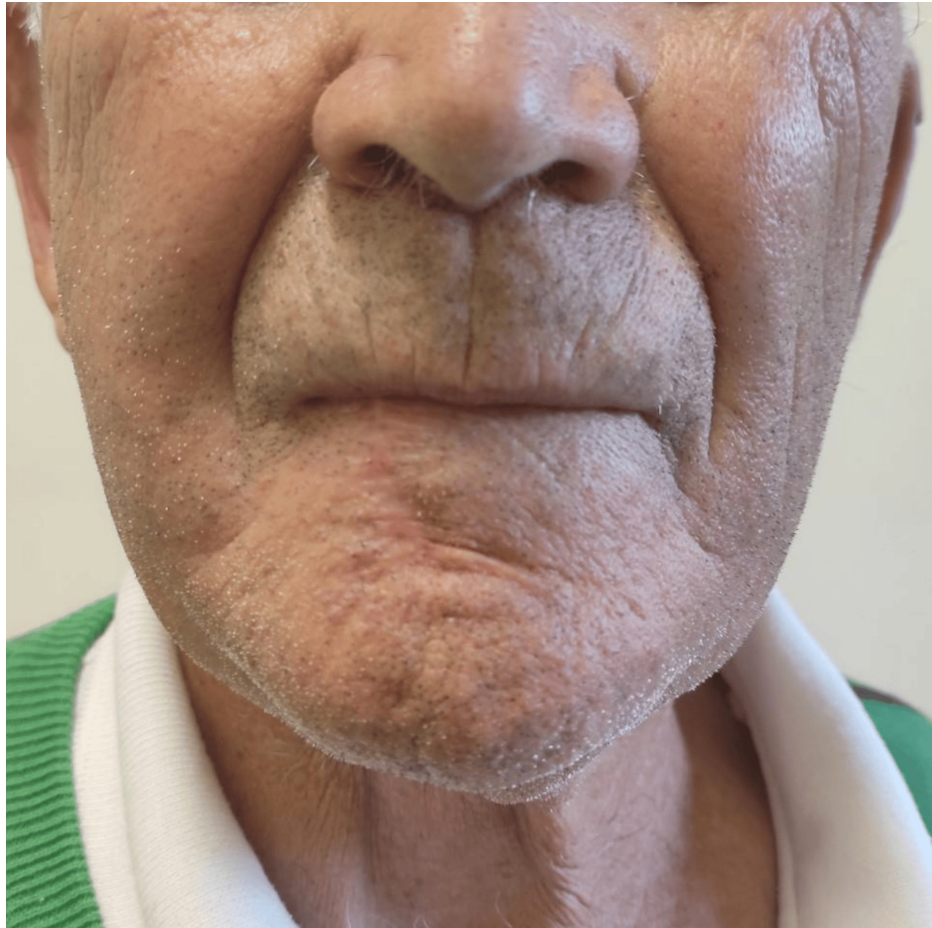
FIGURE 6: Six months post-surgery

The patient experienced some postoperative discomfort, which resolved quickly with oral medication. He maintained preserved oral competence and did not require physical rehabilitation. During follow-up, there were no clinical or imaging signs of recurrence or distant metastasis.