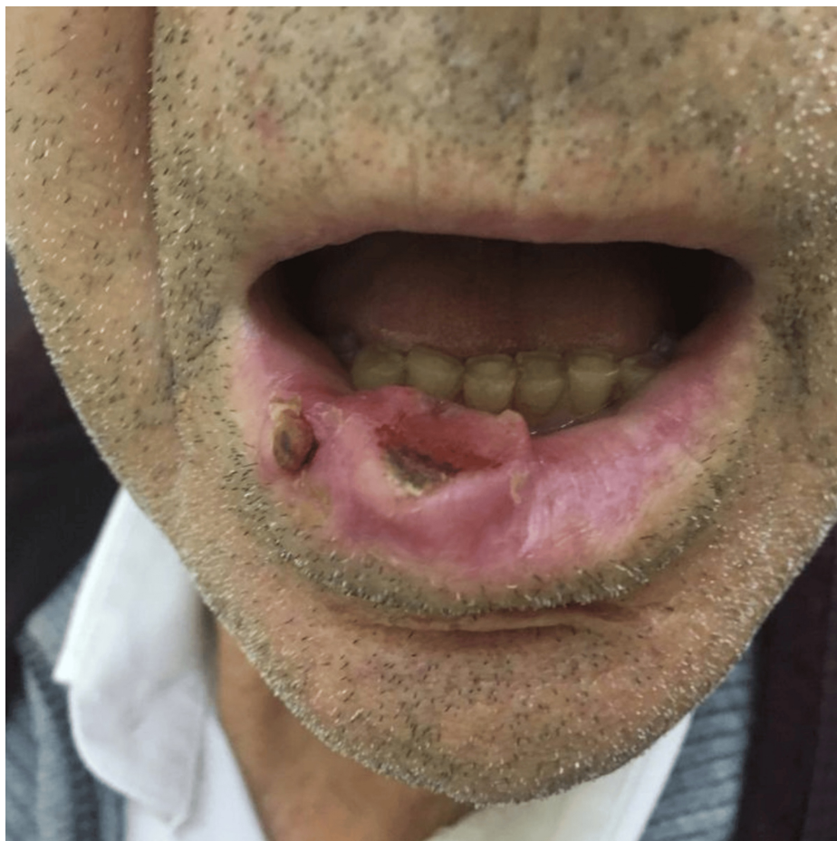
FIGURE 1: Ulcerated lesion affecting the right and central regions of the lower lip

An MRI was performed, revealing a 29 \times 18 mm mass in the lower lip (Figure 2) and enlarged right level I lymph nodes, with the largest measuring 9 mm in diameter (Figure 3).