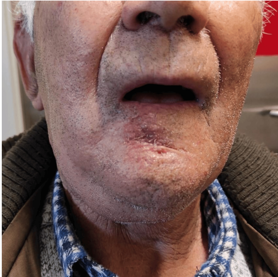
FIGURE 5: One month post-surgery