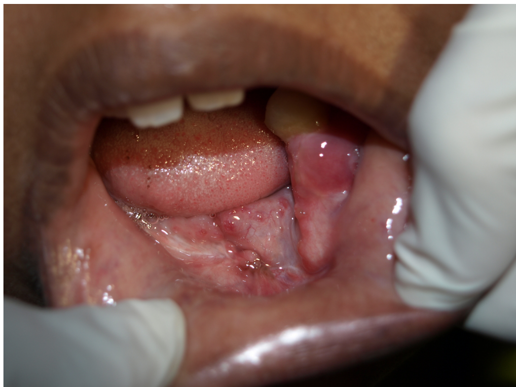
FIGURE 3: Intraoral missing tooth

Urine and blood routine investigations revealed normal results. Orthopantomogram reveals the presence of surgical plating in relation to the 36 and 37 periapical regions, and a 4 cm discontinuity in the lower cortical region of the mandible in the left premolar region. The patient has a resected mandible leaving a 1 cm cortical border in the right side of the mandible, and a thickening of the fractured edges in the right body of the mandible with an interposed 0.5 cm radiolucency between the fractured edges, as noted in Figure 4.