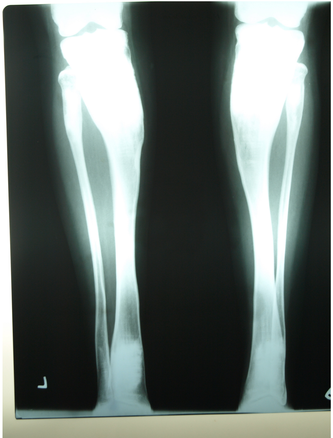
FIGURE 6: Radiograph of legs showing increased radio opacity

Figure 7, a radiograph of the pelvic bone, also reveals an increased radio-opacity of the bone, with a healing fracture site in the left femur, which also denotes the site of malunion due to improper positioning of the fracture edges.