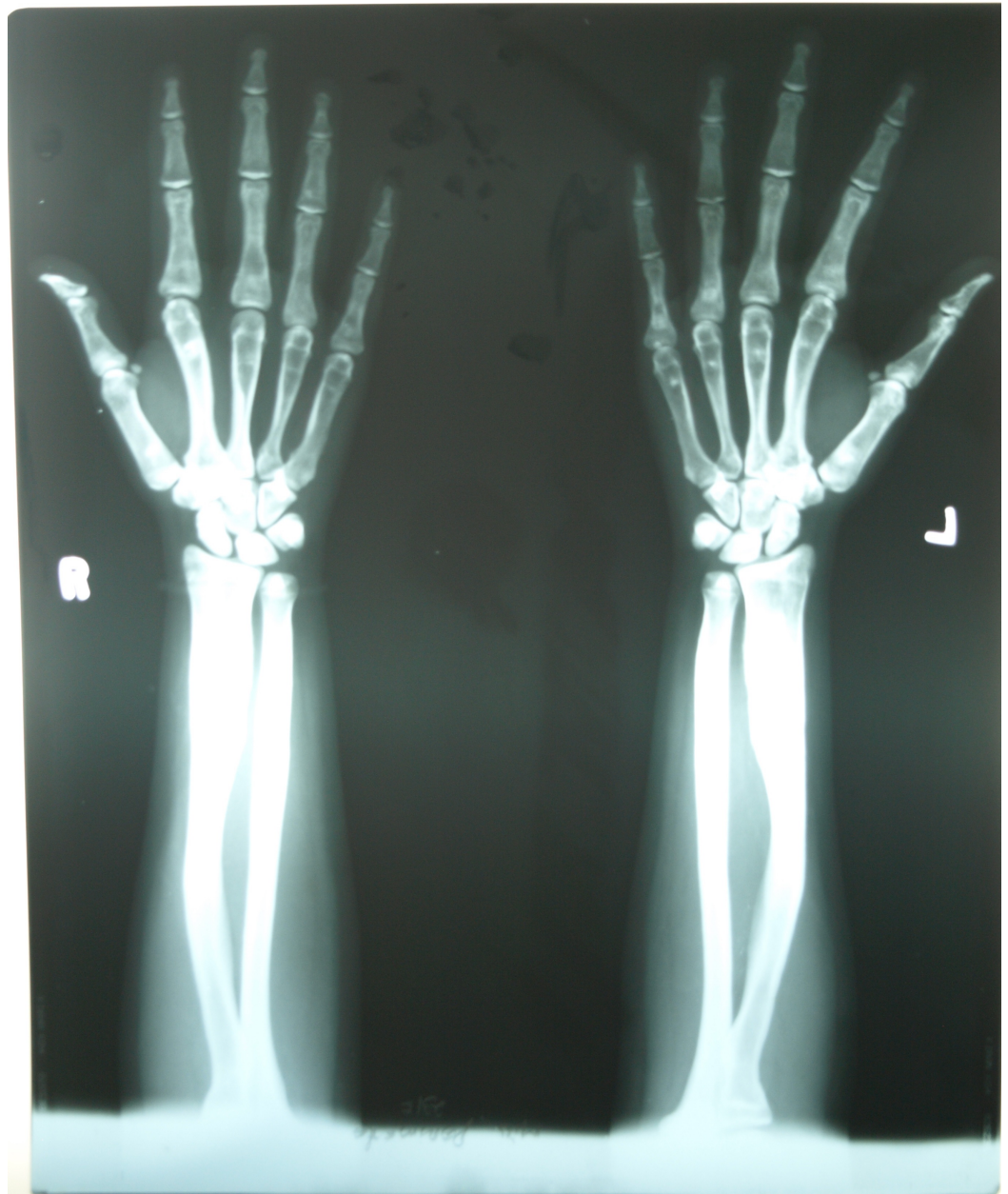
FIGURE 5: Radiograph of hands showing increased radio-opacity