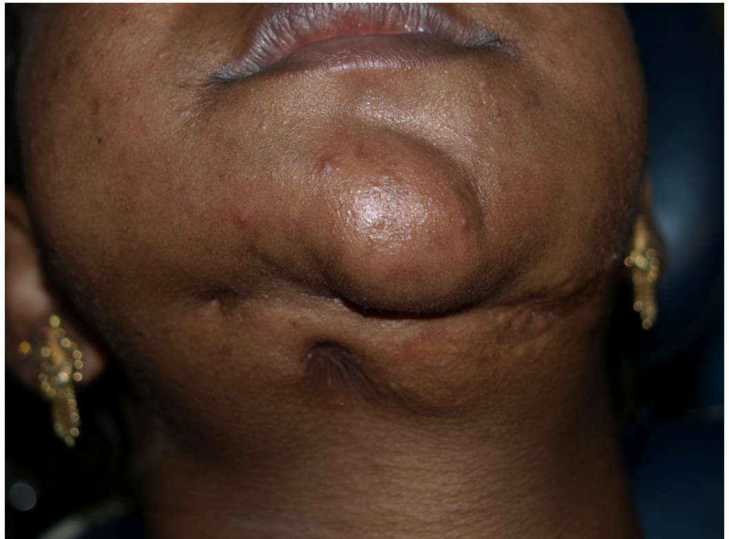
FIGURE 2: Scar in the lower border of mandible

One right submandibular lymph node is palpable, tender, firm in consistency, freely mobile, and measuring around 1.5 cm × 1.5 cm in size. The patient's ability to open her mouth is restricted, with an interincisal distance of 35 mm. Limited jaw movements were noted. Teeth missing were 15, 16, 27, 31, 32, 33, 34, 35, 41, 42, 43, 44, 45, 46, and 47 (Figure 3).