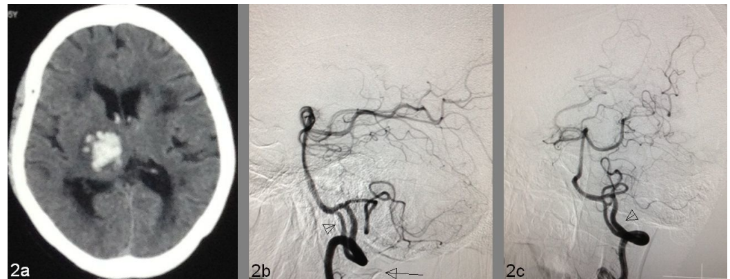
FIGURE 2: Intracranial vertebral artery fenestration in a 54-year-old man with a right thalamic bleed

2A: Plain CT scan shows a right thalamic bleed. 2B: VA fenestration involving both intracranial (arrowhead) and extracranial segments in lateral view on selective left VA angiography, the long arrow indicating the bony impression of the posterior arch of the C1 vertebra. 2C: Oblique view of VA fenestration (arrowhead). Length/width of the right limb is 20.7 mm/2.2 mm and of the left limb is 33.5 mm/3.1 mm. VA diameters distal to fenestration is 3.4 mm and proximal measurement is 3.9 mm.