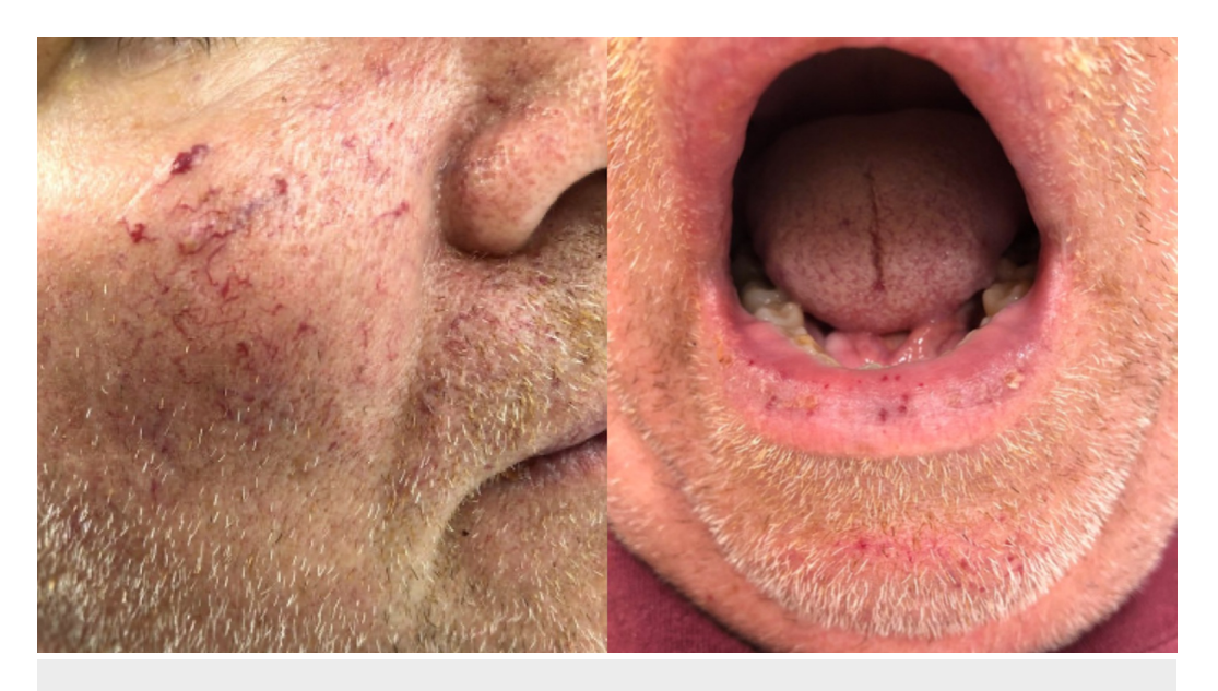
FIGURE 1: Mucocutaneous telangiectasias

A 60-year-old male with a history of recurrent epistaxis since childhood presented with four weeks of intermittent fevers, fatigue, new-onset word-finding difficulties, slurred speech, headaches, blurred vision, and nausea. Upon presentation, he was febrile and tachycardic. Physical exam was notable for delayed speech, impaired concentration, multiple mucocutaneous telangiectasias (Figure 1), and left-sided weakness. Further investigation revealed a history of recurrent gastrointestinal bleeding in his mother and a sister with recurrent epistaxis since childhood. Labs were significant for leukocytosis (white blood cell count [WBC] 16 \times 10^3/\mu L) with a neutrophilic predominance.