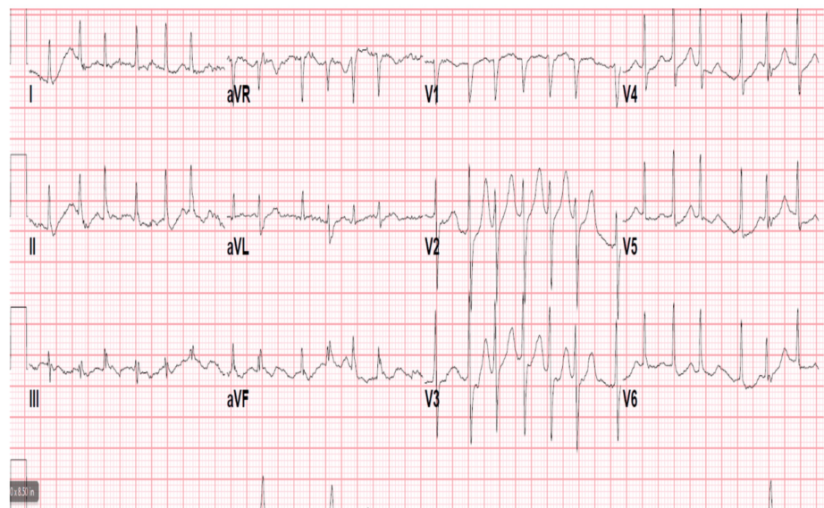
FIGURE 1: Atrial Fibrillation with Rapid Ventricular Response