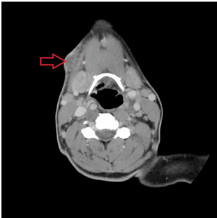
FIGURE 1: CT scan, showing the neck abscess in the anterior part on the right side.