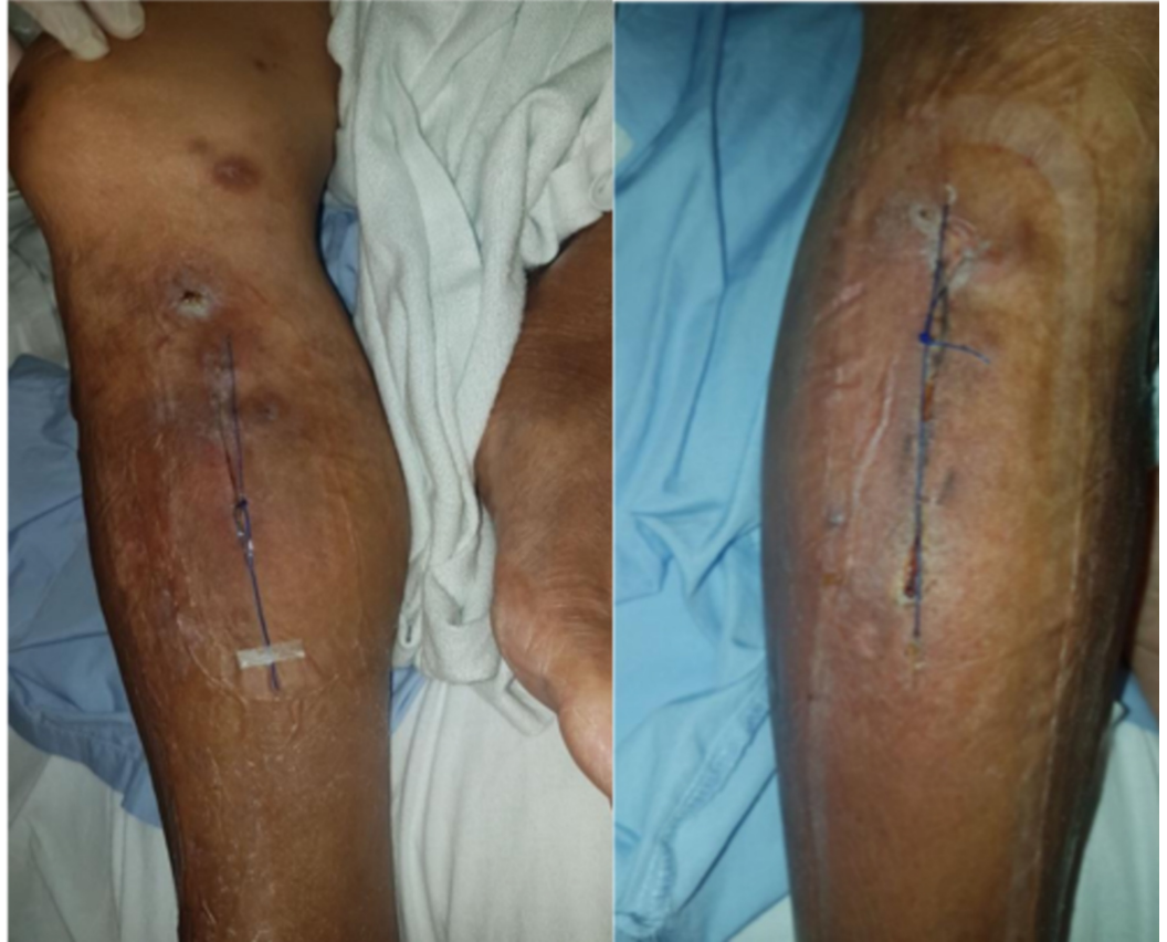
FIGURE 18: Fully healed wound in clinic a month later

On wound inspection in the clinic a month later, both wounds had healed well (Figure 18).