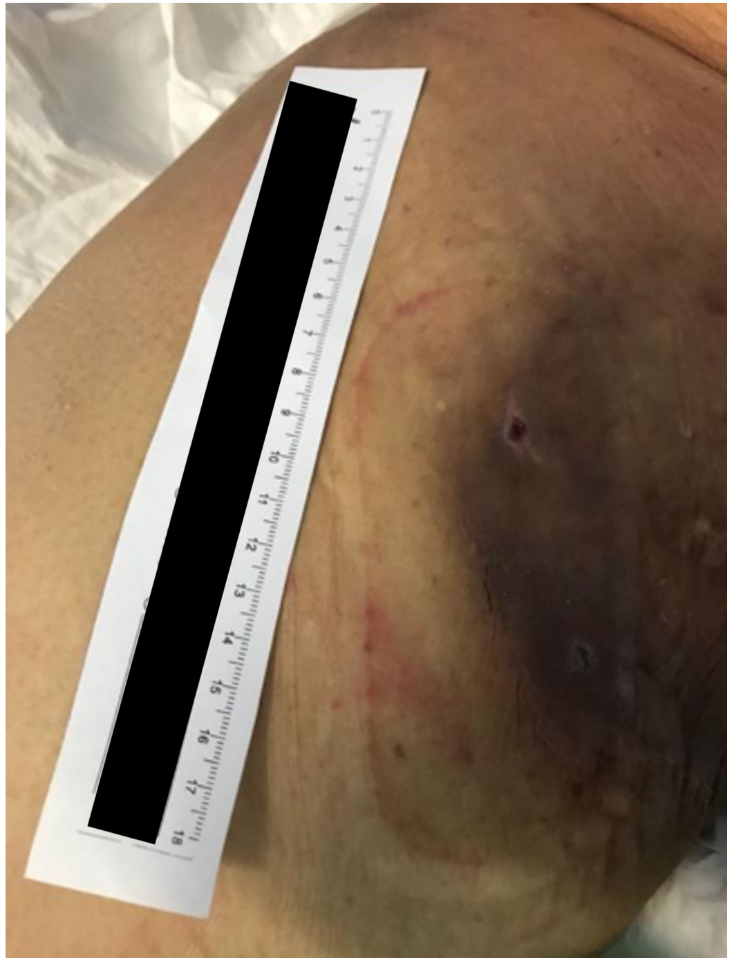
FIGURE 9: Two weeks after placement of Prevena demonstrating reduction in size of hematoma and improvement in overlying skin

On inspection a week later, the hematoma was smaller at 9 x 4 cm, and no longer fluctuant (Figure 9). As fluid drainage had ceased, the Prevena was discontinued.