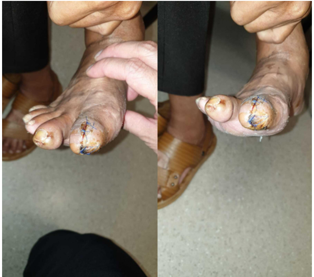
FIGURE 5: At two weeks, the wound was healing well; left and right show different views of the same wound

A week later, the skin condition had improved and the wound was healing well (Figure 5).