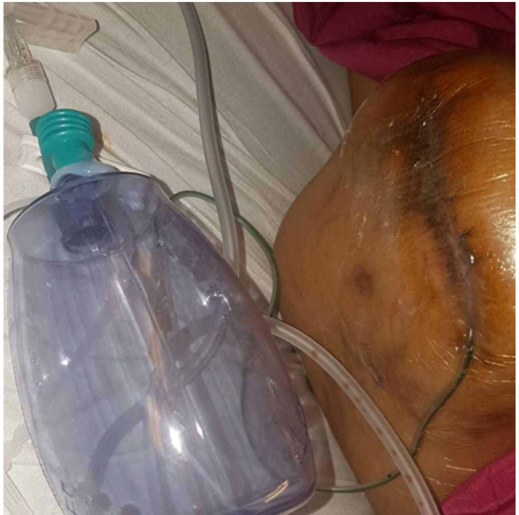
FIGURE 16: After closure of the wound, with Radivac drain placed between the sutures