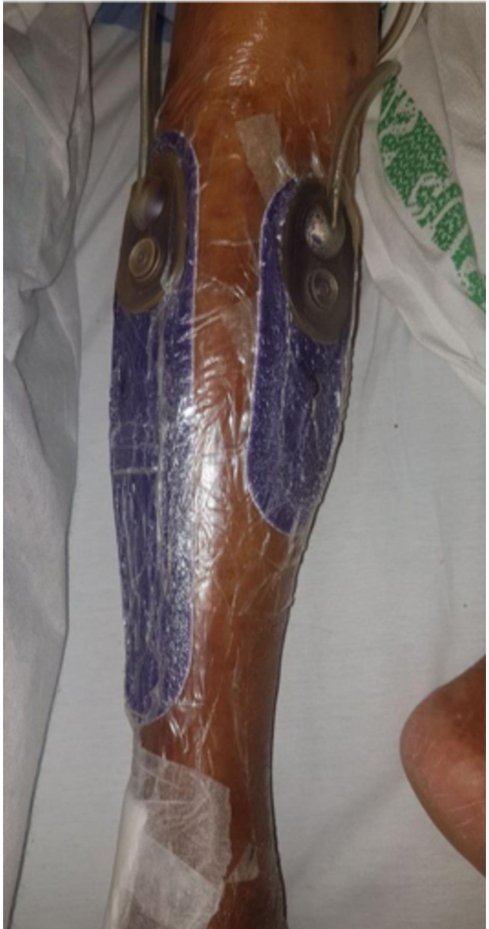
FIGURE 17: Demonstrating application of Prevena dressings to