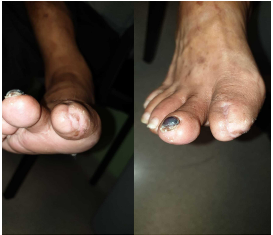
FIGURE 6: Complete healing at two months; left and right show different views of the same wound