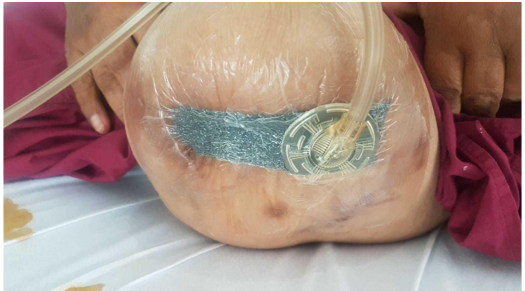
FIGURE 14: The external appearance after application of combination home-made Prevena plus intra-cavity VAC dressing

The lateral cavity and tract under the closed suture-line was packed with a long wedge of VAC foam, and a “home-made” Prevena created by lining both edges of the sutured portion of the wound with the VAC drape, leaving a small gap along the length of the suture line. The conventional VAC foam was cut into a strip and laid over the suture-line and the foam-packed cavity, the wound sealed with overlying VAC drape and the suction head applied, resulting in an “all-in-one” combination of intra-cavity VAC to promote granulation and reduce exudate, and superficial negative pressure to the suture-line to recreate the benefits of ciNPT (Figure 14).