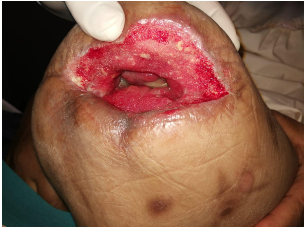
FIGURE 12: Two weeks of VAC therapy after index operation, wound clean and granulating