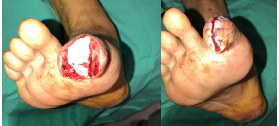
FIGURE 2: Excision of the distal phalanx and closure over Promogran Prisma dressing

Angioplasty to the SFA, popliteal, PTA, and peroneal arteries was performed with concurrent excision of the terminal phalanx and primary closure of the skin envelope over a Promogran™ (Acelity and KCI Headquarters, San Antonio, TX) and application of ciNPT using the Prevena™ Customizable™ (Acelity, San Antonio, US) system (Figure 2).