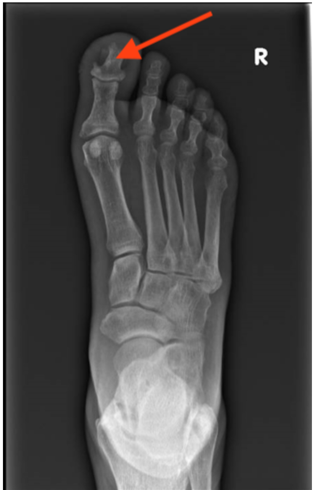
FIGURE 1: X-ray showing erosion of distal phalanx of the right big toe

A duplex arterial scan showed multiple stenoses of the superficial femoral artery (SFA),