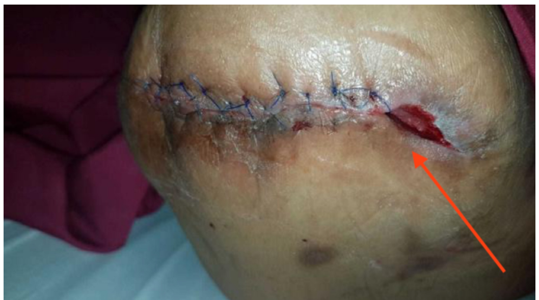
FIGURE 13: Demonstrating the wound appearance after

She subsequently underwent secondary suture to the AKA stump, however the lateral 1 inch of the stump was too retracted to close and remained slightly sloughy with persistent exudate, so it was left open. There was a long medial tract beneath the length of the sutured skin (Figure 13).