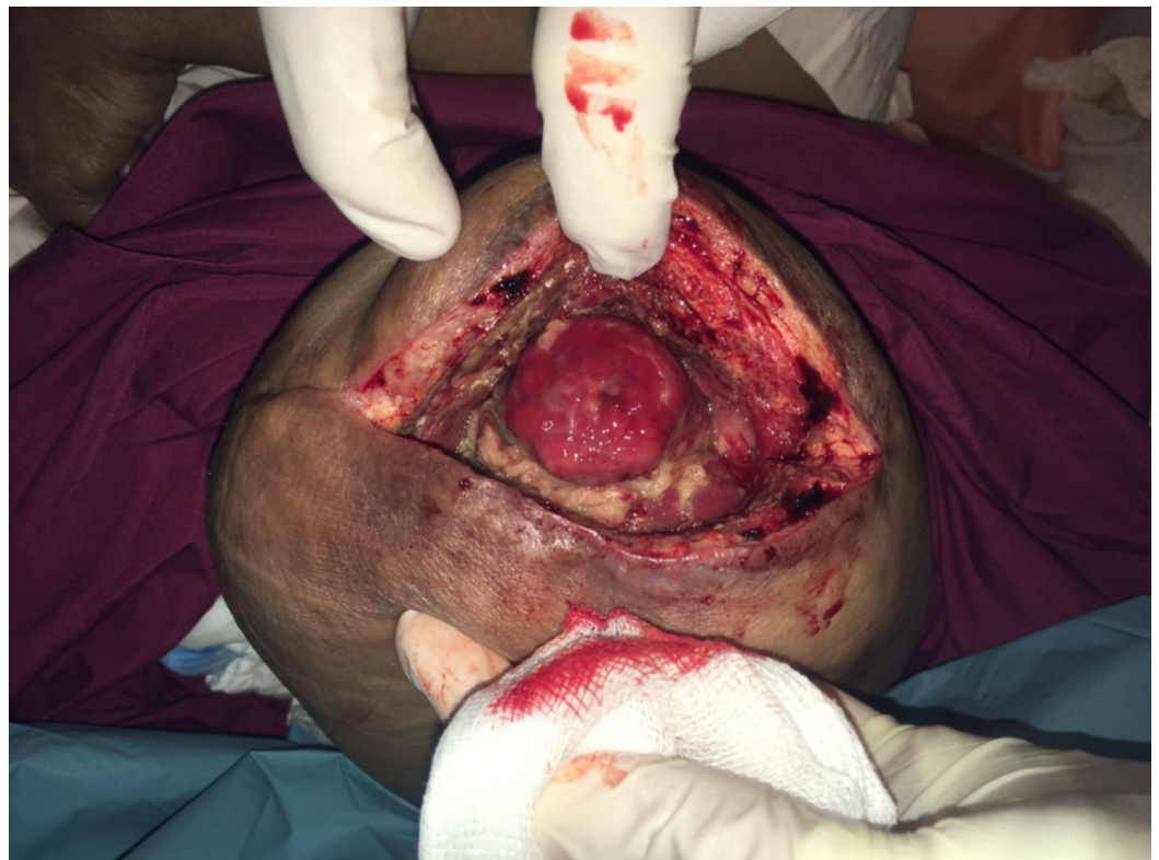
FIGURE 11: Infected above knee amputation wound after exploration and debridement

She was started on intravenous co-amoxiclav and underwent exploration and debridement of the AKA stump the following day. The wound cavity measured 15 x 20 cm with copious infected old hematoma, dirty necrotic fat and muscle, and exposed bone with overlying unhealthy granulation (Figure 11). The wound was opened and curetted, and washout with Pulsavac® (Zimmer Inc, Warsaw, IN) lavage was performed. The wound was dressed with a Vacuum-Assisted Closure (VAC) (KCI, Acelity, San Antonio, Texas) dressing. Wound cultures grew methicillin-resistant Staphylococcus aureus .