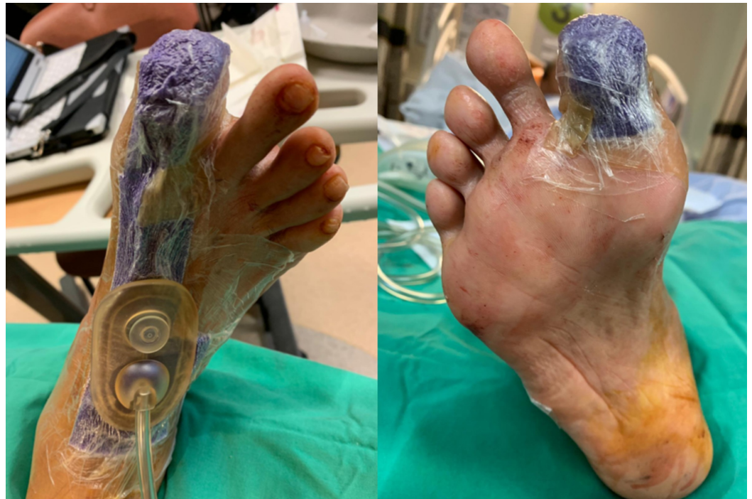
FIGURE 3: Technique of applying Prevena to big toe wound closure

Left – dorsal view. Right – plantar view.