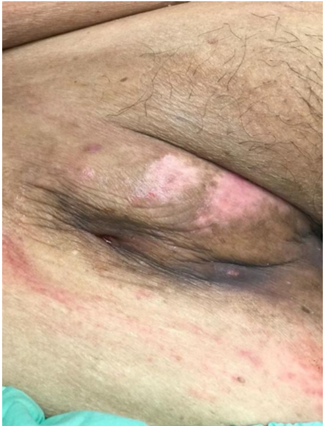
FIGURE 10: Four weeks from first application, with recovery of overlying skin and resolution of fluid drainage

Two weeks later, which was four weeks from the time of first application, the previously-deemed nonviable skin now appeared healthy although somewhat scarred (Figure 10). She was given an open appointment.