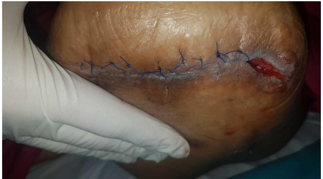
FIGURE 15: Demonstrating skin union of the sutured portion at one week, with contraction of the lateral wound

Eventually, the remaining 1-inch cavity became less exudative and began contracting, and the lateral wound was secondarily sutured successfully, with placement of a Radovac drain between the sutures (Figure 16). This was removed after fourteen days when drainage stopped. At follow up two months later, the wound had fully healed.