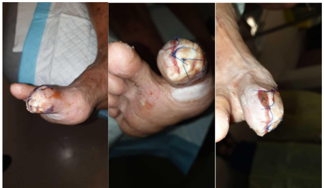
FIGURE 4: At one week, the wound remained clean and viable; left, middle and right panels show different views of the wound

He was able to ambulate the following day and was discharged. The Prevena dressing was removed after one week. The wound was clean and uninfected, with some minimal maceration of the skin. The wound was dressed with daily povidone iodine gauze (Figure 4).