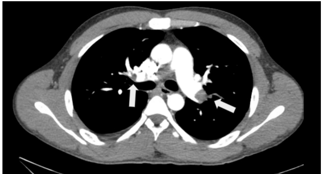
FIGURE 1: Pulmonary angiography with evidence of filling defects bilaterally in pulmonary vasculature, as noted with arrows.

Initial laboratory workup included a normal troponin, blood urea nitrogen, creatinine and serum electrolytes. Complete blood count showed a mean corpuscular volume of 104 without anemia and no other abnormalities. EKG showed sinus tachycardia, while chest x-ray showed no abnormalities. A Wells score of 4 was calculated, suggesting moderate risk of PE, after which a D-dimer of 1,371 ng/mL was obtained. B-type natriuretic peptide level (BNP) was 288 pg/mL (normal range). Pulmonary angiography showed extensive bilateral PE (Figure 1), and transthoracic echocardiogram showed right ventricular strain consistent with submassive PE (Figure 2).