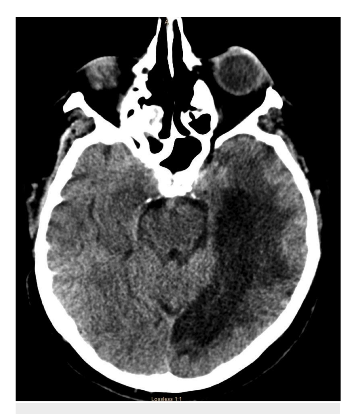
FIGURE 2: CT scan of the head that shows no acute changes. There is an area of hypodensity in the right temporal region, consistent with patient know prior history of left PCA embolic stroke