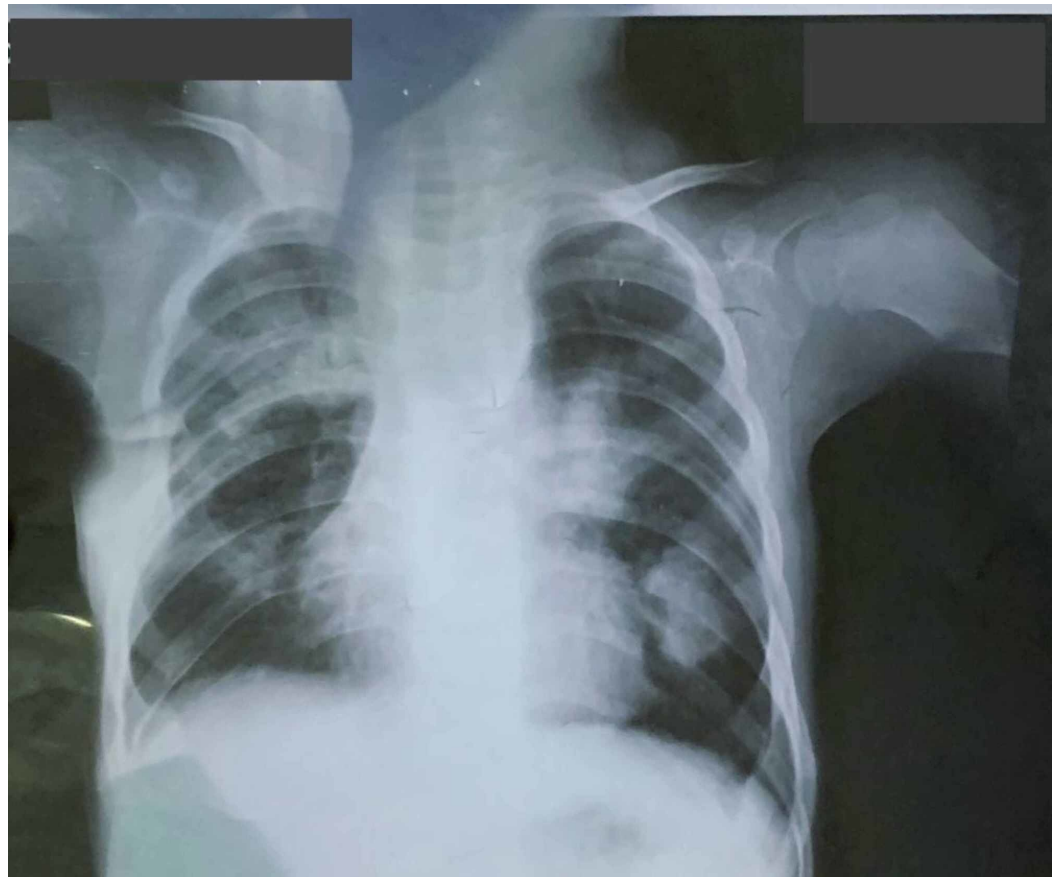
FIGURE 4: Chest X-ray of the patient before surgery

we were able to diagnose this case as being one of HME, leading to recurrent respiratory infections.