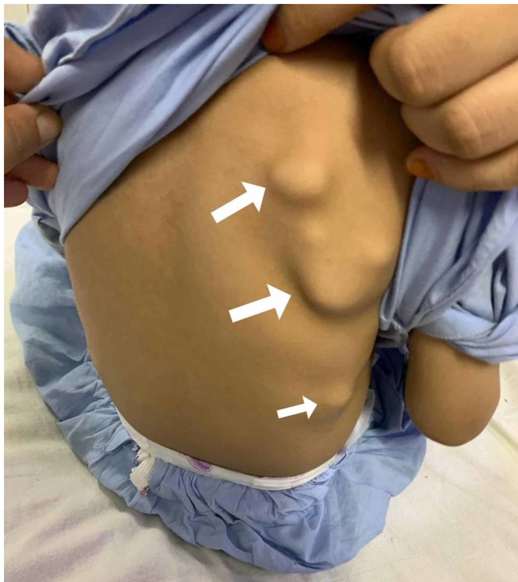
FIGURE 3: Bony outgrowths on the patient's back