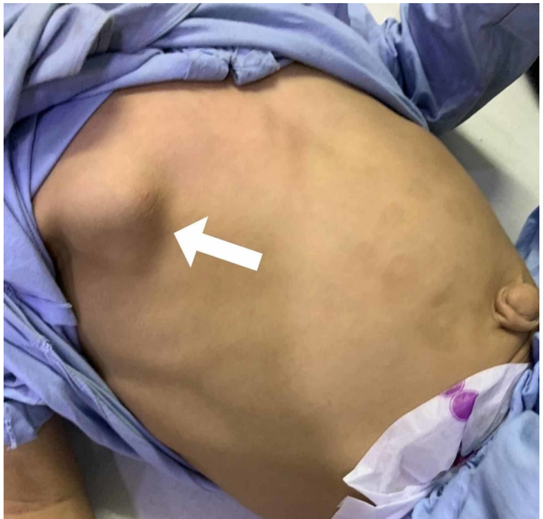
FIGURE 2: Bony outgrowths on the patient's chest