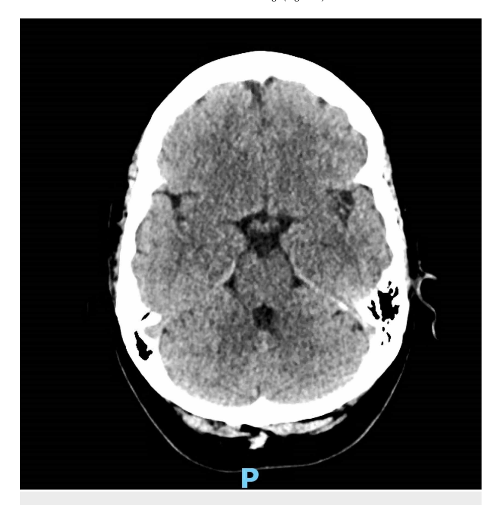
FIGURE 3: Non-contrast computed tomography head revealing no acute intracranial findings

Non-contrast CT head revealed no acute intracranial findings (Figure 3).