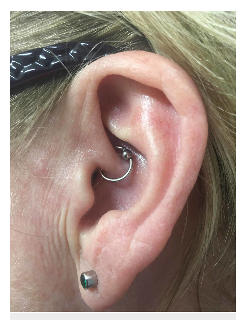
FIGURE 1: Daith piercing located at the crus of the helix in the left ear

She was asymptomatic till the beginning of March 2019 when the headaches returned but now on the right side. It was once again in the right occipital region. She stated that she would have episodes of headaches that lasted for almost four weeks and affected her activities of daily living. She had a daith piercing done on the right side, and the headaches resolved (Figure 2).