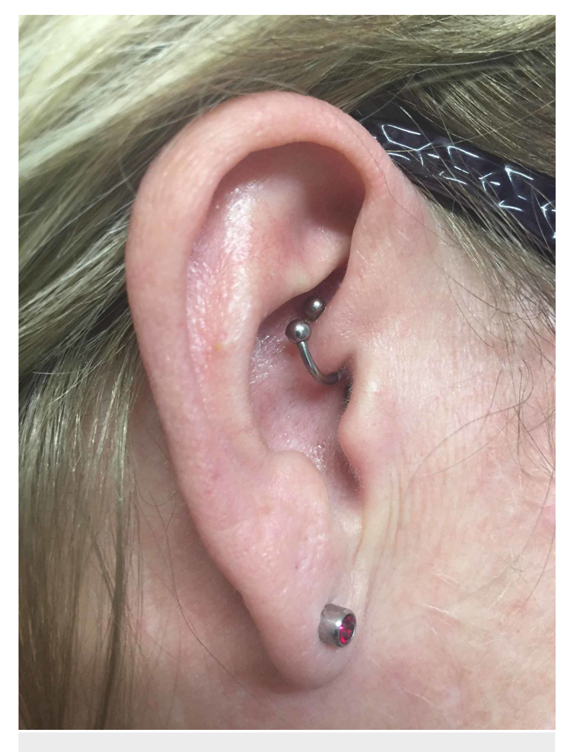
FIGURE 2: Daith piercing located at the crus of the helix in the right ear

She was asymptomatic till the beginning of March 2019 when the headaches returned but now on the right side. It was once again in the right occipital region. She stated that she would have episodes of headaches that lasted for almost four weeks and affected her activities of daily living. She had a daith piercing done on the right side, and the headaches resolved (Figure 2).