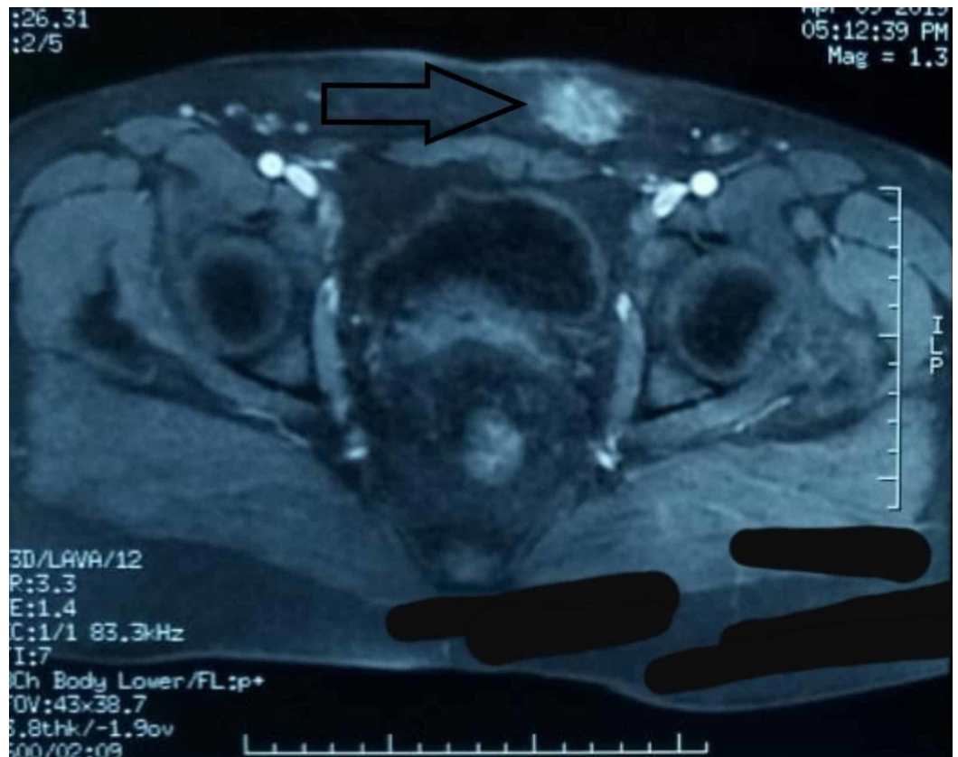
FIGURE 2: Pelvic magnetic resonance imaging (MRI) scan showing a mass (black arrow) of the left lateral pelvic wall

Under general anesthesia, surgical exploration revealed a mass at the left lower rectus wall, and en bloc excision of the mass was performed (Figure 3). Anatomopathology confirmed the presence of benign fibrous tissue with multiple endometrial glands and stroma, confirming the diagnosis of endometriosis. The patient was seen at regular intervals, and she was symptom-free at the six-month follow-up review.