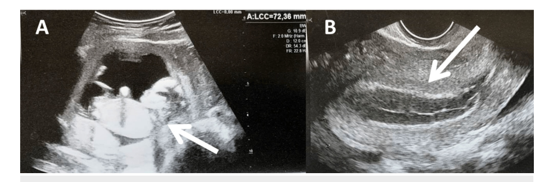
FIGURE 1: Ultrasound images.

The patient was hemodynamically stable, with no tachycardia or hypotension. The first examination was reassuring, as there was no bleeding, and a pelvic ultrasound showed an intrauterine pregnancy with an embryo measuring 72 mm, biometric indices were consistent with the menstrual age, and cardiac activity was visualized (Figure 1). The patient was discharged, but she was reevaluated the next day for worsening pain with vomiting.