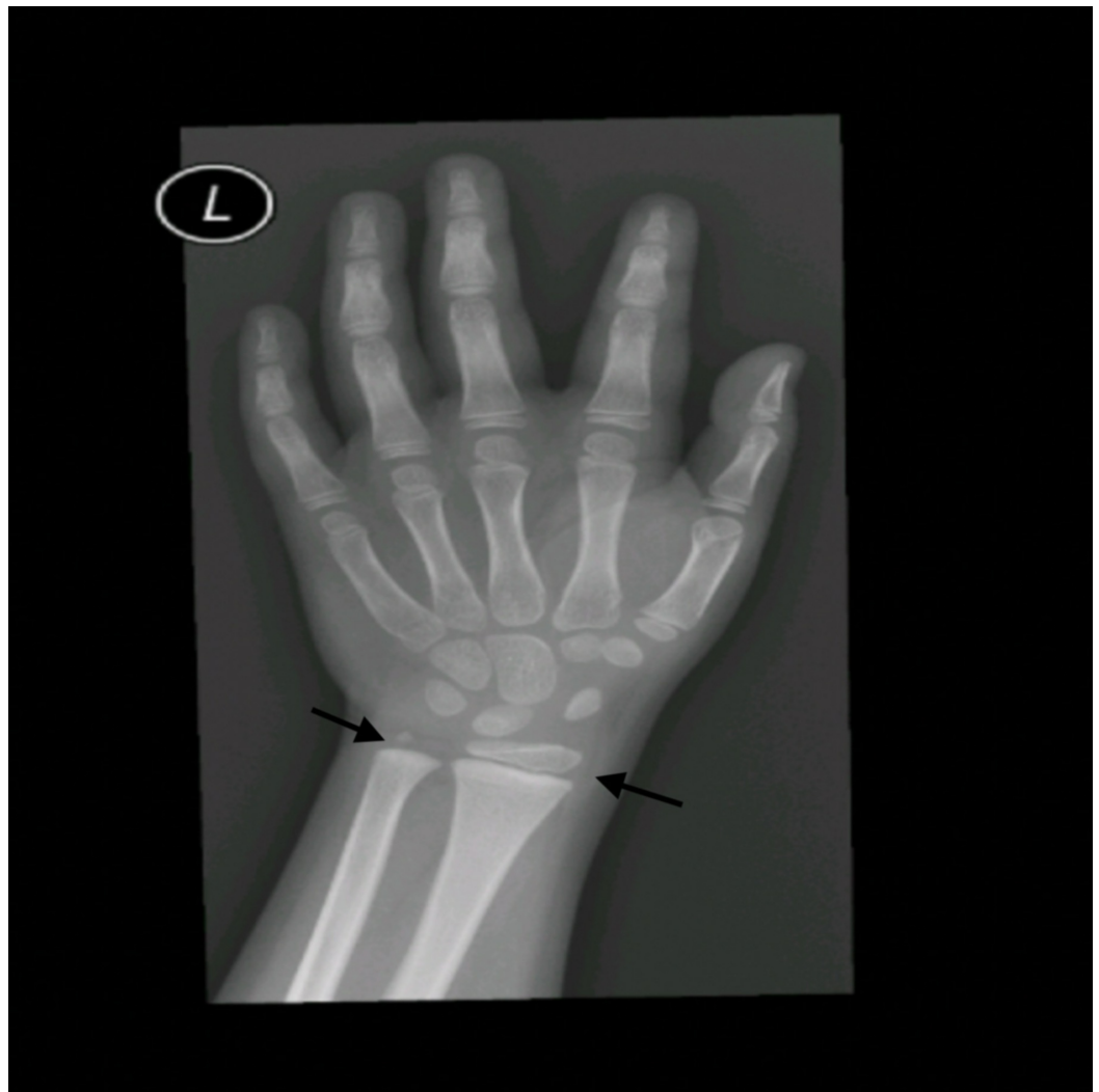
FIGURE 2: Bone age imaging reveals two-year advanced age